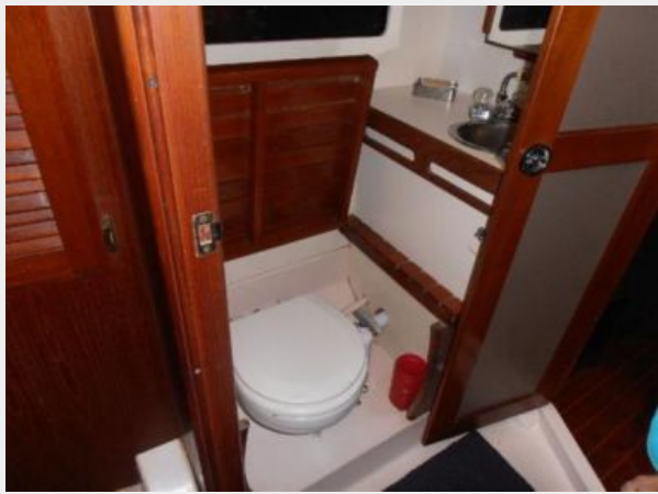
Head with access from the Salon as well as the Master Cabin