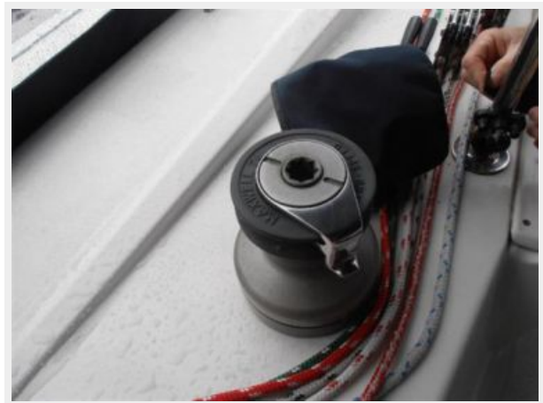
All Lines Color Coded