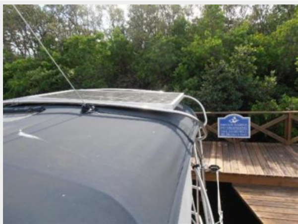
Duel Solar Panels w/SS Strong Framing