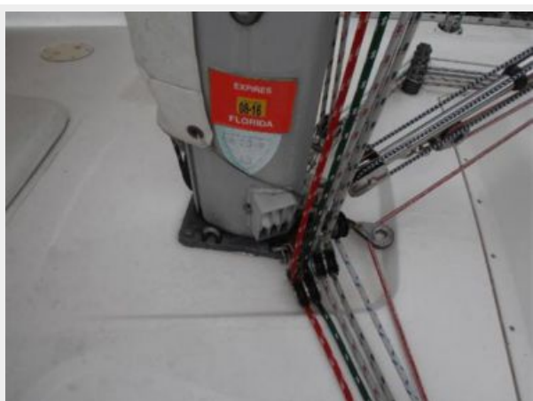
Fully Sealed Mast Step