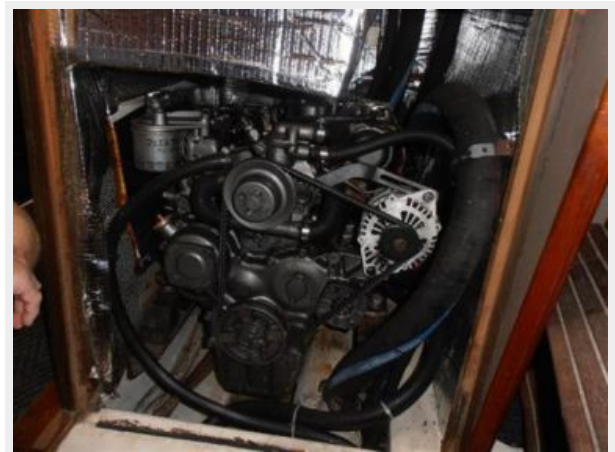
40HP Yanmar Easy Access