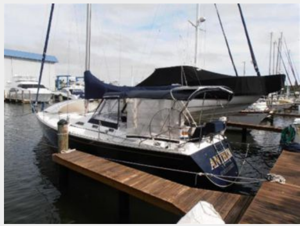
"Anthem" in her home berth