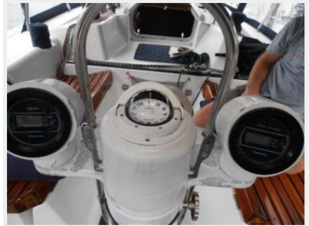
At the Helm New Compass