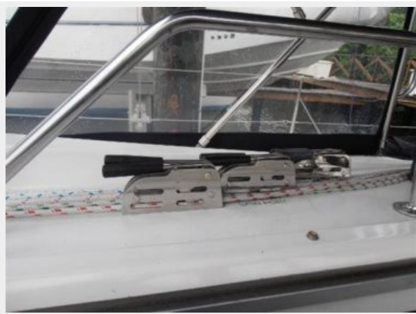
Garhaur Heavy Duty Clutches