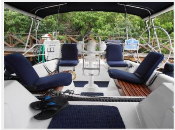
Cockpit with four comfortable seats