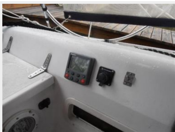
Auto-Pilot and VHF Microphone Plug in