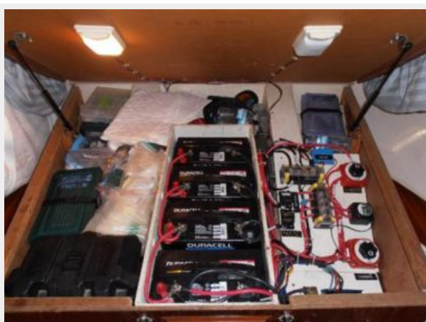
Main Bank of Batteries Under Queen Berth