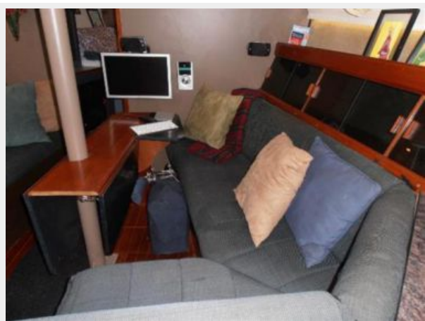
Starboard Settee w/22" LCD TV