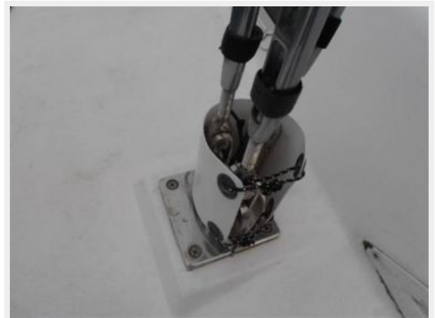
Protective chafe guards