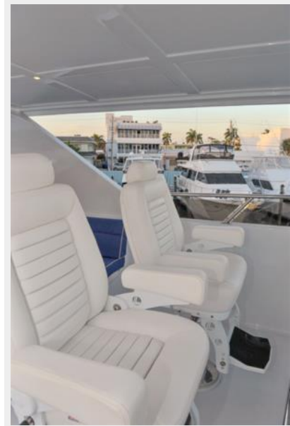
Flybridge Helm Seats