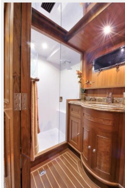
Master Stateroom Bath