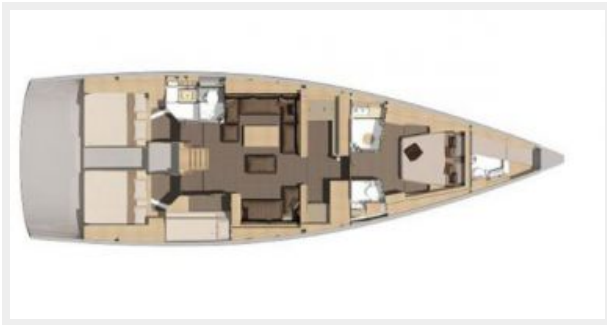
Dufour 56 E Layout 3