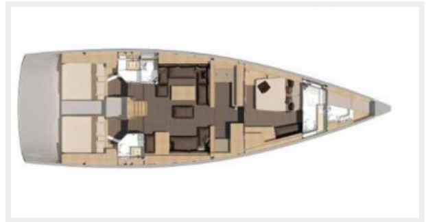
Dufour 56 E Layout 4