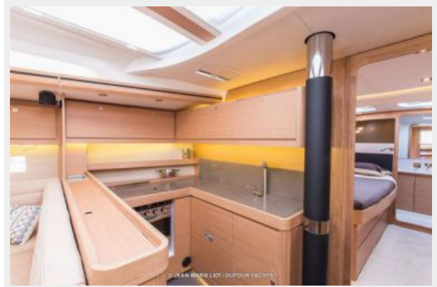
Dufour 56 E Galley