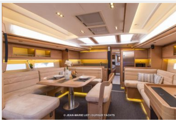
Dufour 56 E Salon