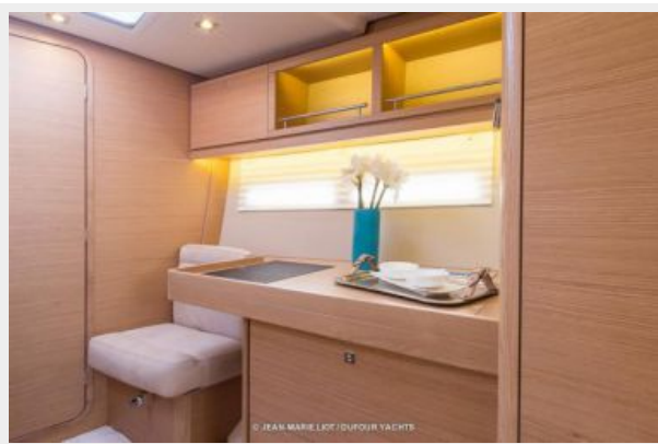
Dufour 56 E Master Vanity