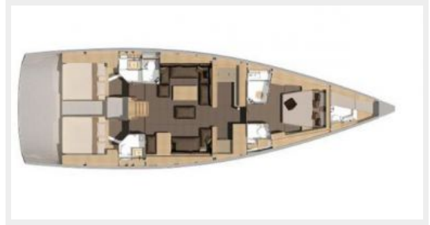
Dufour 56 E Layout 2