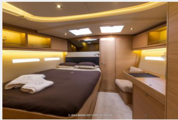
Dufour 56 E Stateroom