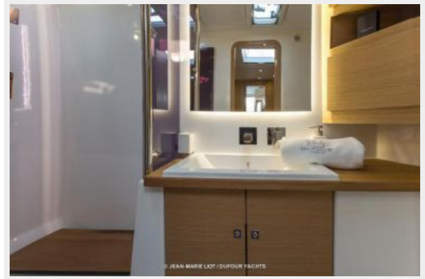
Dufour 56 E Head