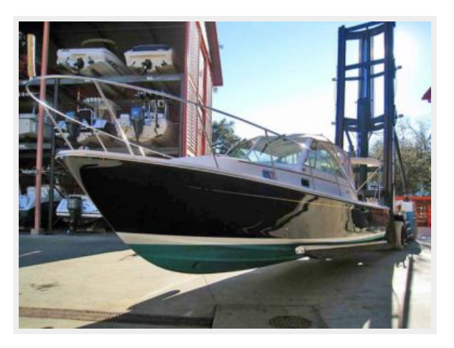
Port Bow on Lift