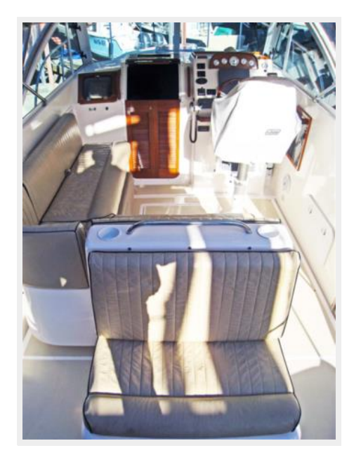
Bridge Deck Seating