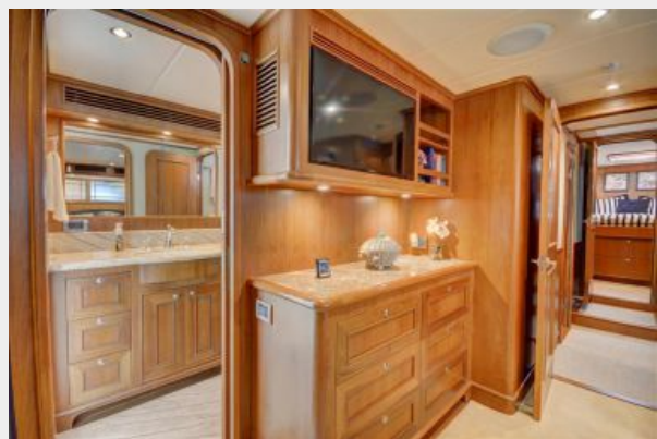
Master Stateroom Entertainment