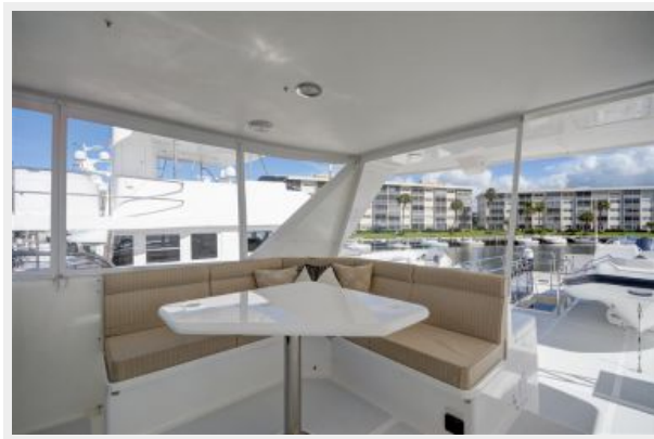
Flybridge Casual Dining Starboard Side