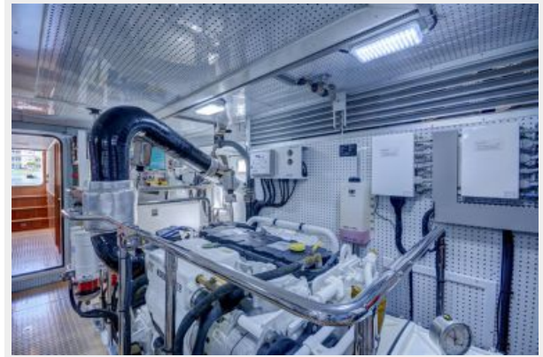
Port Engine - CAT C-9