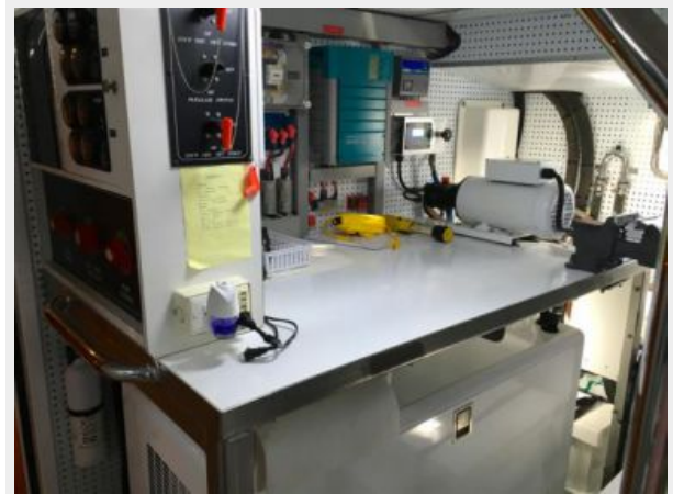
Engine Room Work Bench