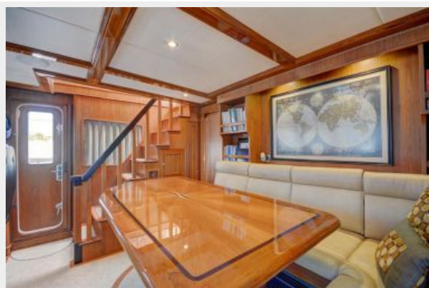
Pilothouse Dining and Stairwell to Flybridge