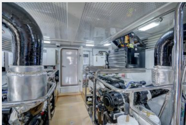
Starboard Engine - CAT C-9