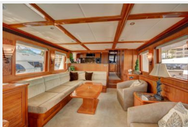
Main Salon "L"-Settee