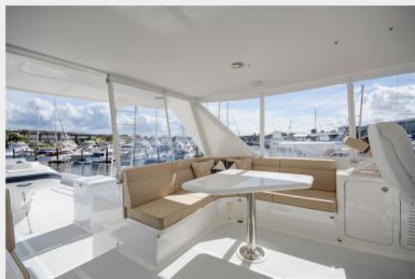
Flybridge Casual Dining Port Side