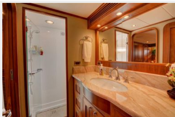
VIP Ensuite Head