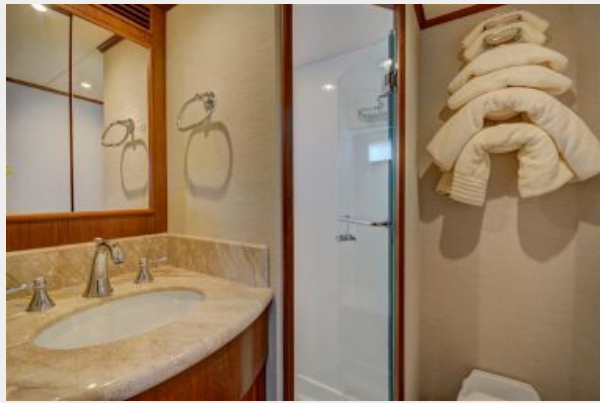
Port Guest Ensuite Head