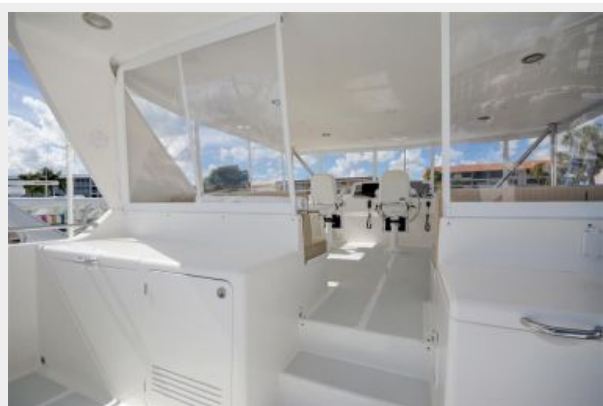
Boat Deck Storage