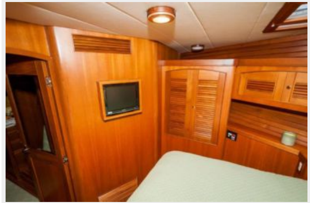
VIP Stateroom Stateroom