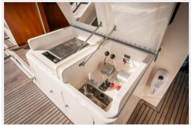
Cockpit Controls and Grill