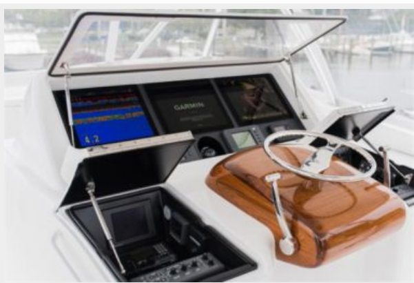
Single Lever Controls/Built in Truster Controls