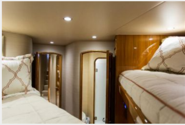
Forward VIP Stateroom