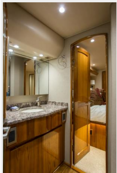
Master Stateroom Head