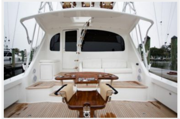
Trillion Series Fighting Chair