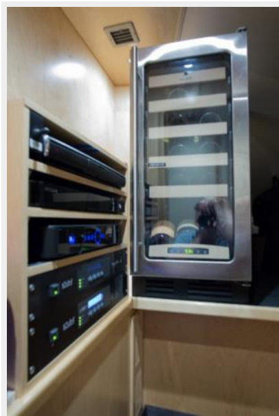
Port Dog House