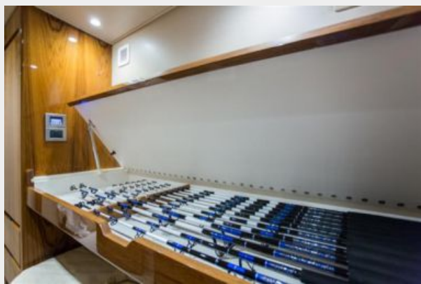
Custom Rod Storage / Crew Stateroom Bunk