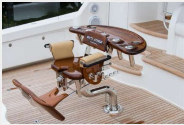
36" Footrest on Fighting Chair