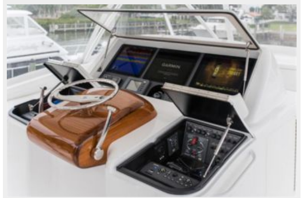
Custom Helm Pod