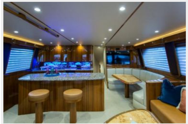
Salon White Lighting