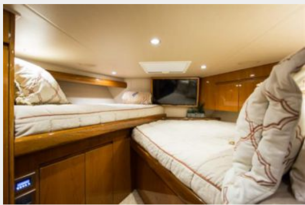
Forward VIP Stateroom