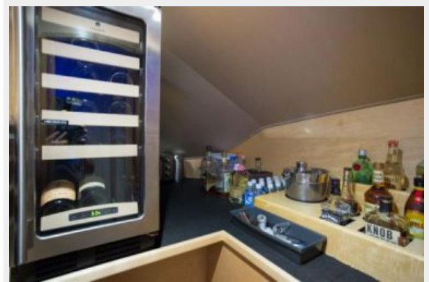
Custom Bar/Wine Cooler