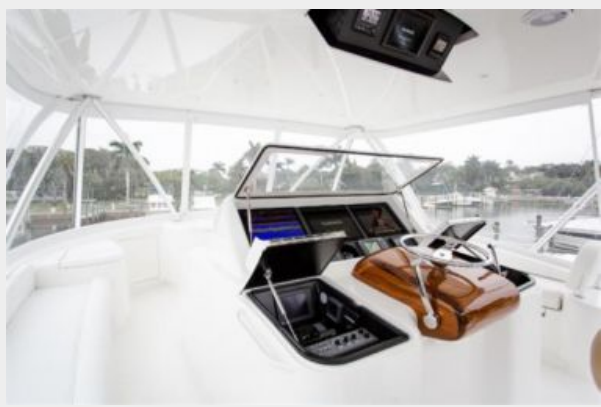
Bridge Helm Station