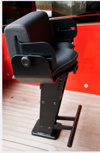
Custom Companion Chair