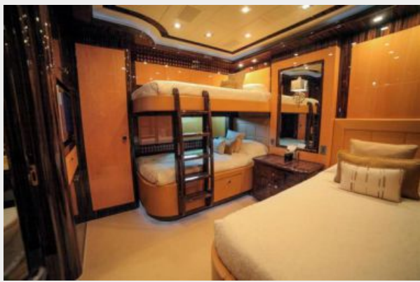
Mangusta 165 - Guest stateroom