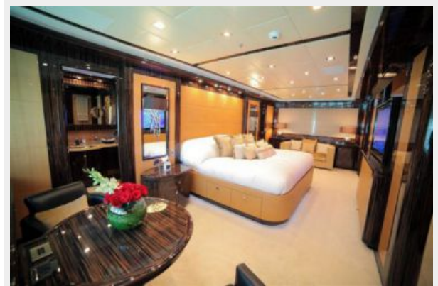
Mangusta 165 - Master stateroom