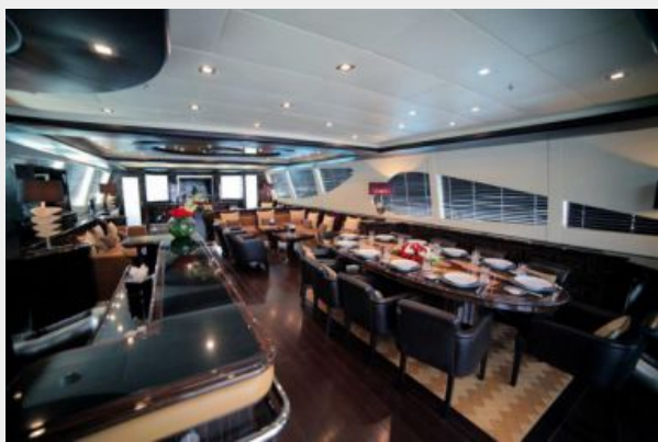
Mangusta 165 - Saloon