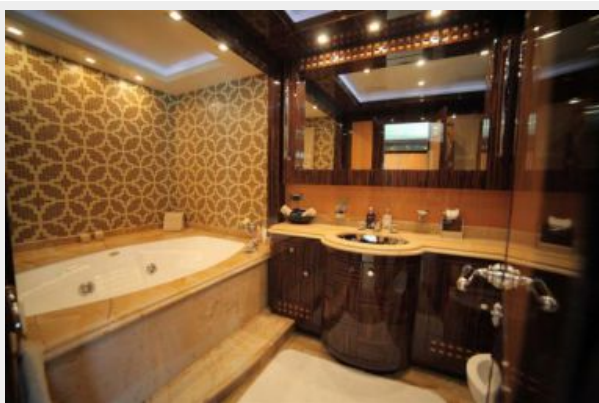
Mangusta 165 - Master bathroom