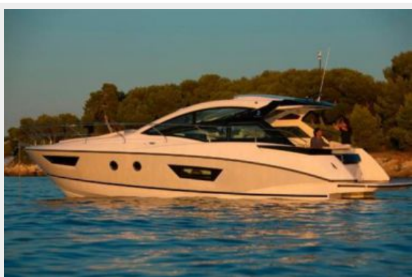
GT 40 at Anchor