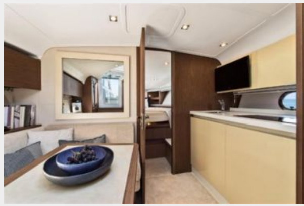
GT 40 Salon and Galley looking Forward