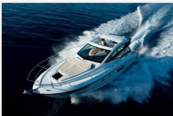
GT 40 Running Profile