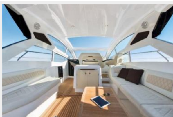
GT 40 Cockpit looking Forward