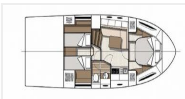
Below Deck Layout