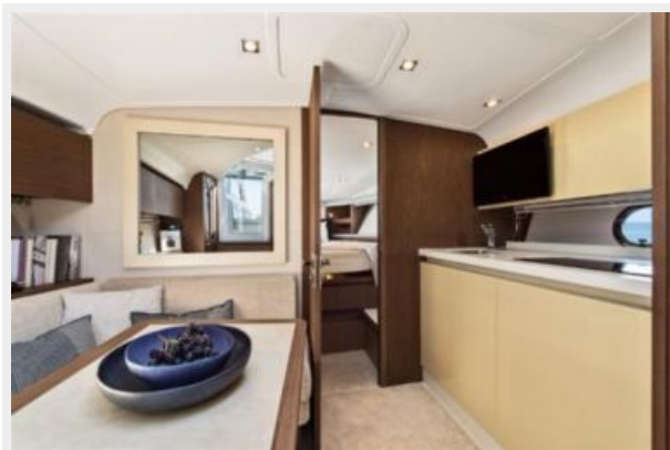
GT 40 Salon and Galley looking Forward