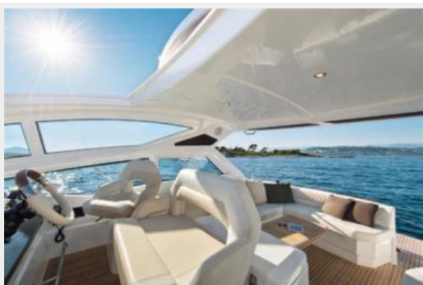
GT 40 Cockpit looking to Starboard