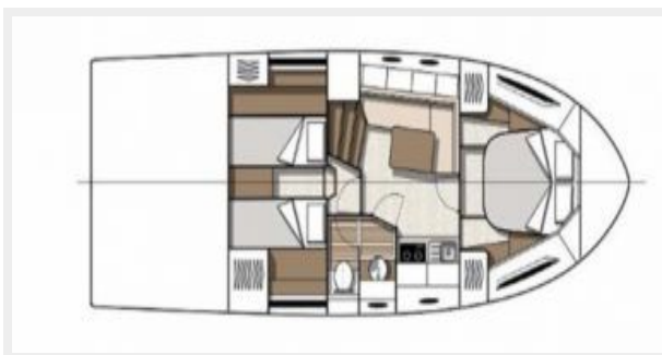
Below Deck Layout