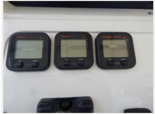
Yamaha Mgmt System