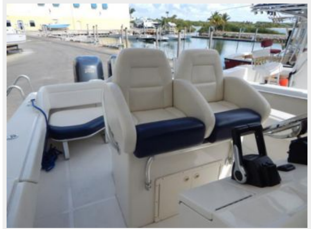
Custom Helm Seats