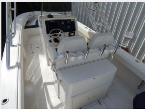
Premium Leaning Post