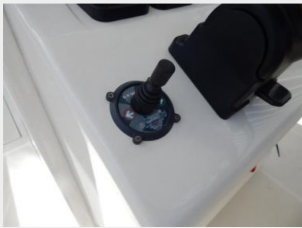
Lewmar Bow Thruster