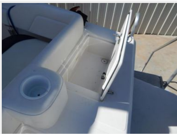
Transom Bait Box