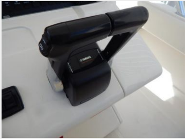
Yamaha 704 Control