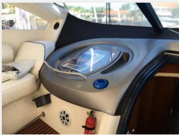
New Brushed Stainless Dash