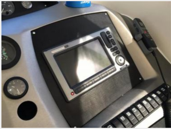
New Raymarine E90 Touchscreen