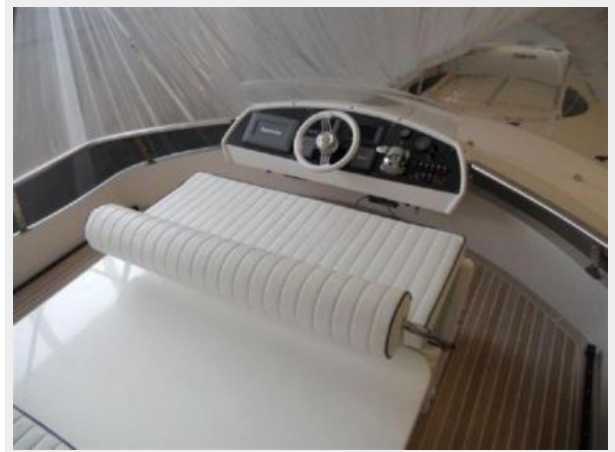
Bridge Looking Forward