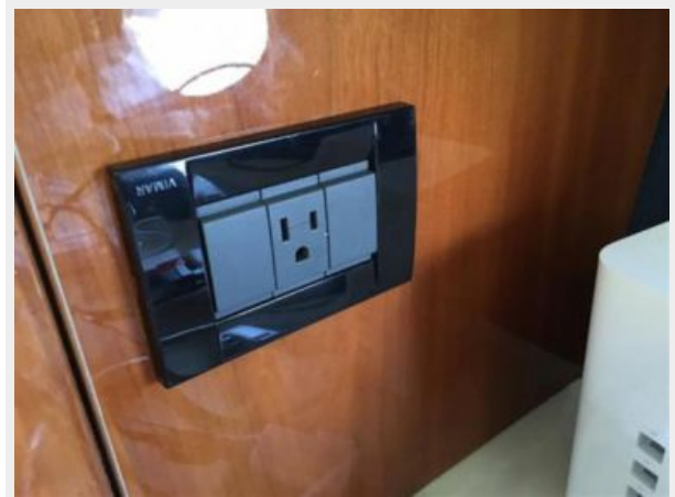
New Vimar 110V Outlets