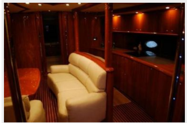
Main Salon and Galley