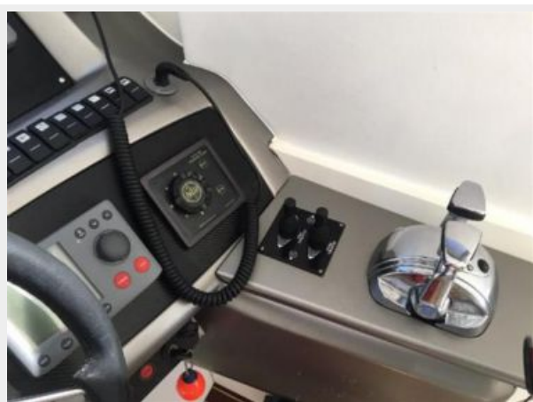
Thruster and Engine Controls