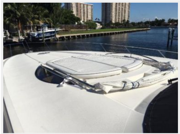
Foredeck Lounge with Bimini