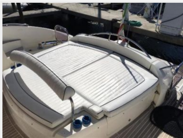
Aft Deck Lounge