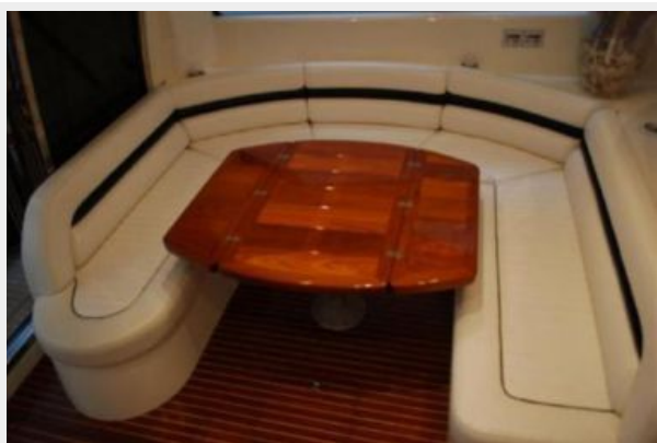
Helm Deck Seating