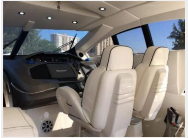
Electric Helm Seats