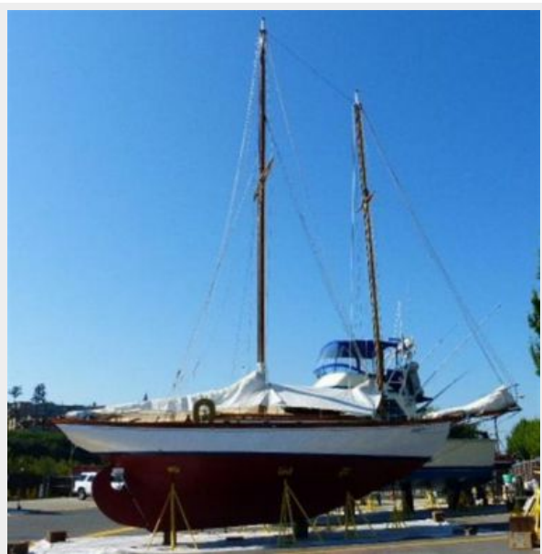
On the Hard II