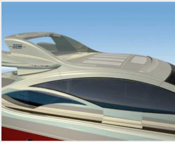
Azimut 68 S