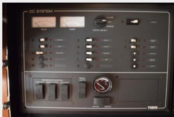
DC Breaker Panel