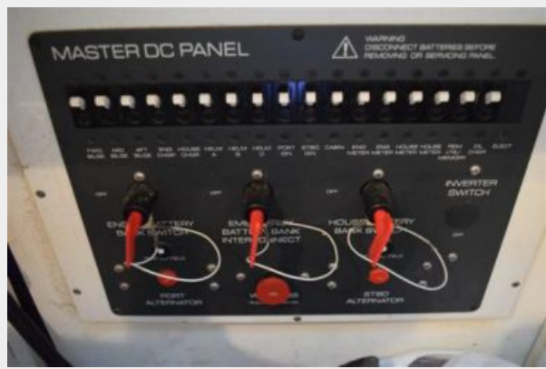
DC Electric Panel