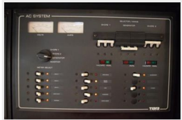
AC Breaker Panel