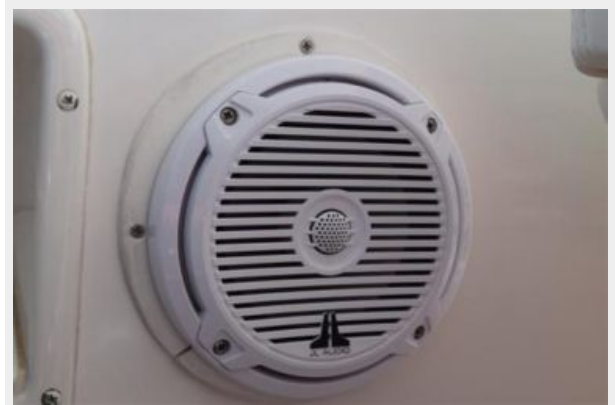
JL Audio Cockpit Speakers