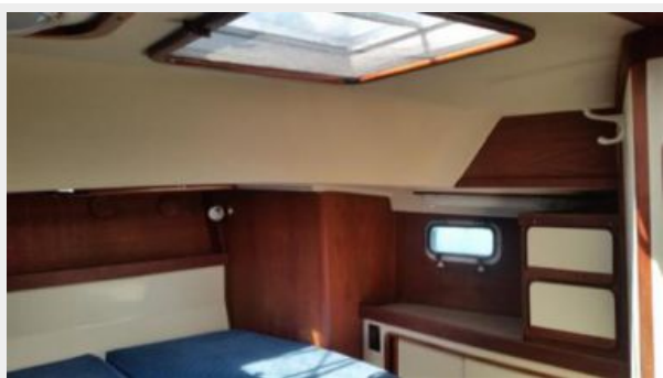
Aft Cabin Port Quarter