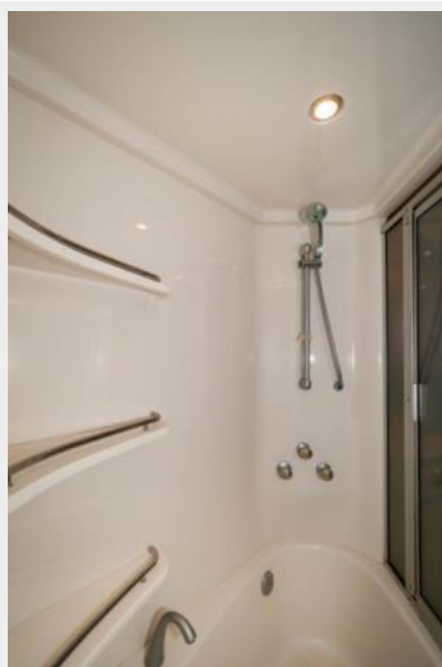
Master Head Shower