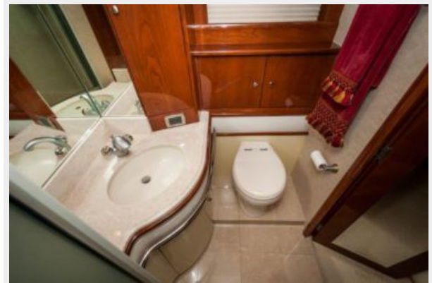
Master Head His