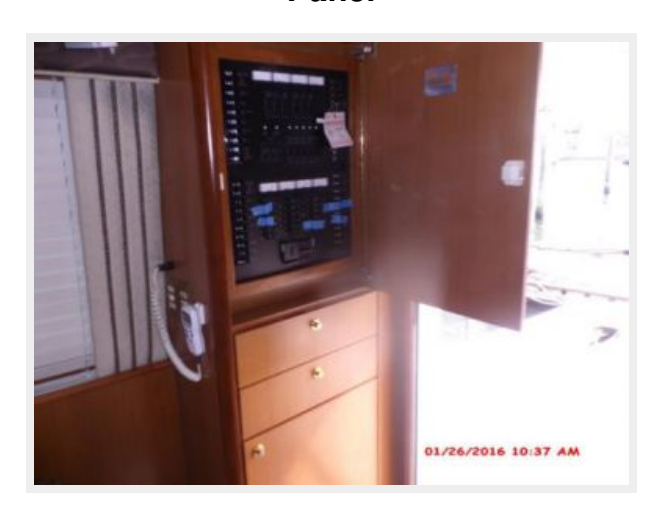
Electrical System / Equipment 1 - Electrical Panel