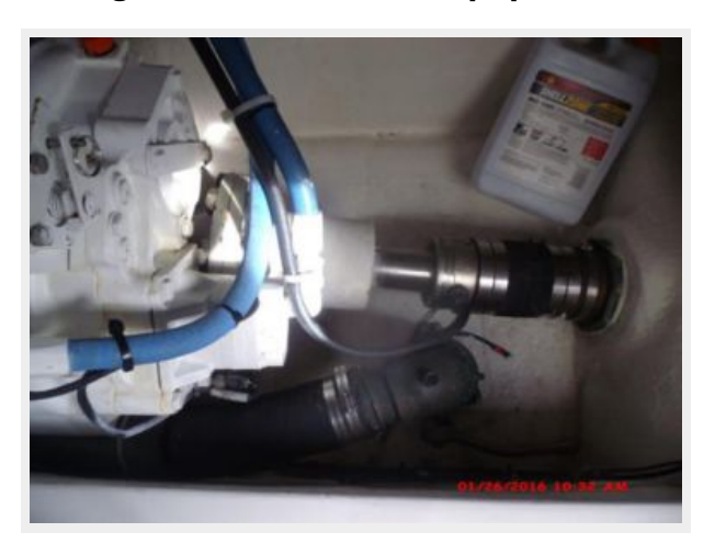
Engine & Mechanical Equipment 7