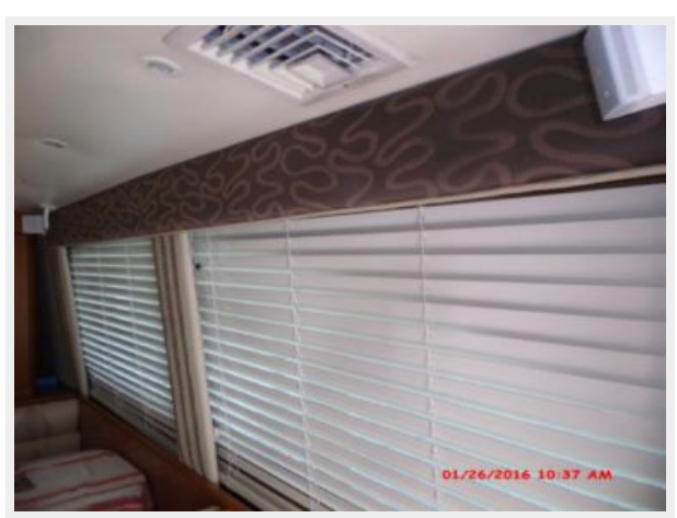
Salon 2 - Blinds