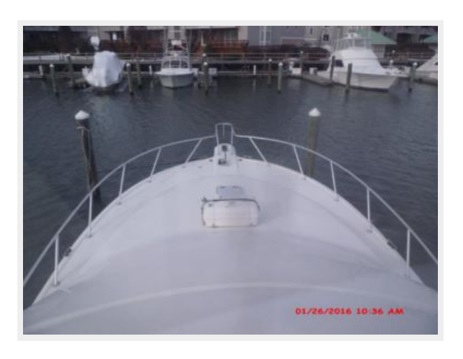
Deck 1 - Bow