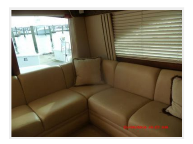
Salon 1 - Sofa