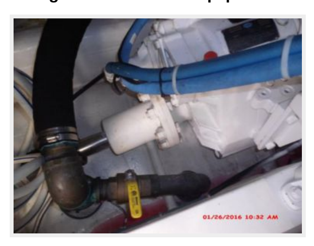
Engine & Mechanical Equipment 4 - Oil Change System