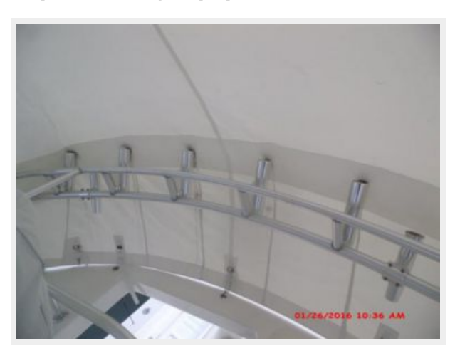
Cockpit / Fishing Equipment 1 - Rod Holders