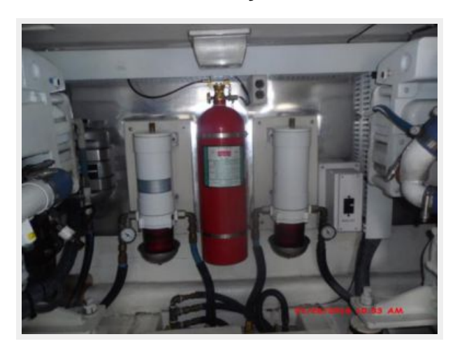
Engine & Mechanical Equipment 5 - Fire Control System