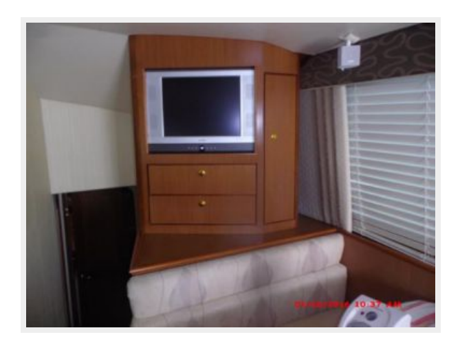
Salon 3 - TV