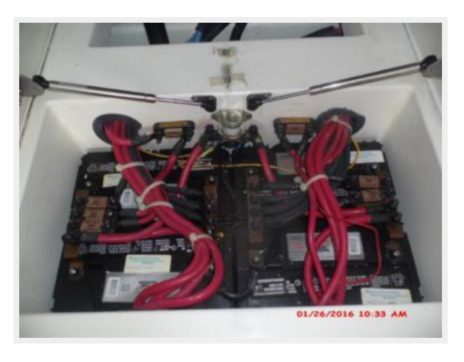
Electrical System / Equipment 2 - Batteries