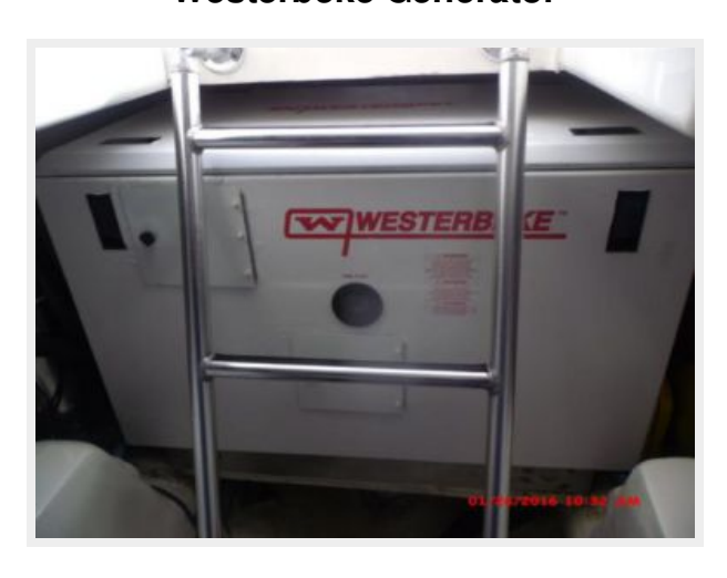
Electrical System / Equipment 3 - Westerbeke Generator