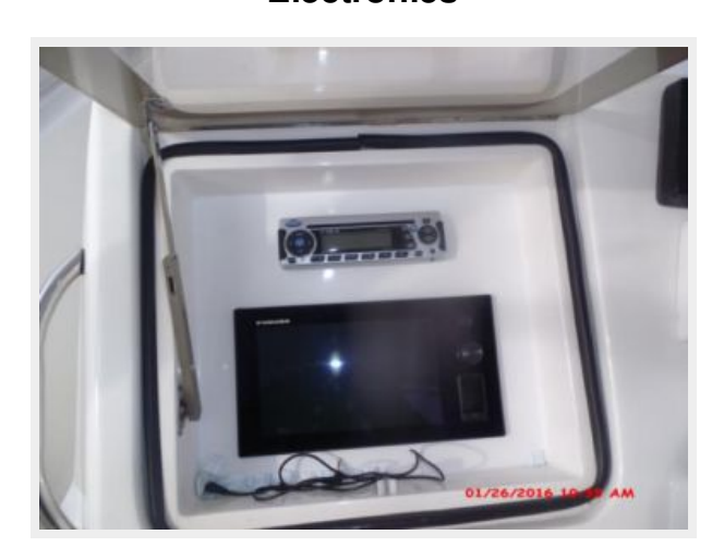
Helm / Electronics & Navigation 3 - Electronics