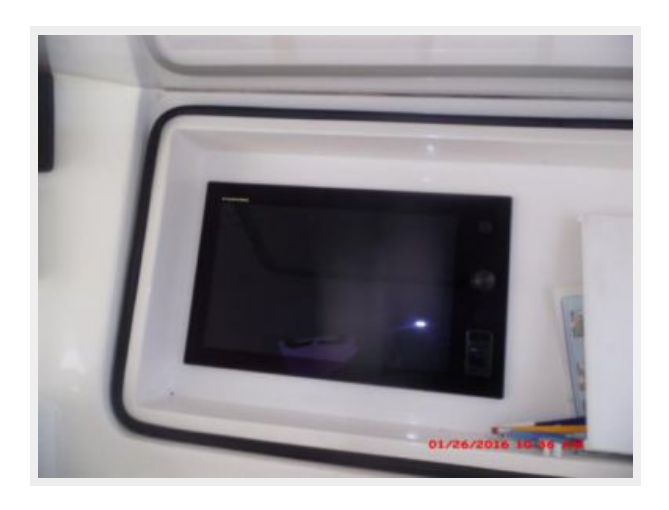
Helm / Electronics & Navigation 2 - Electronics