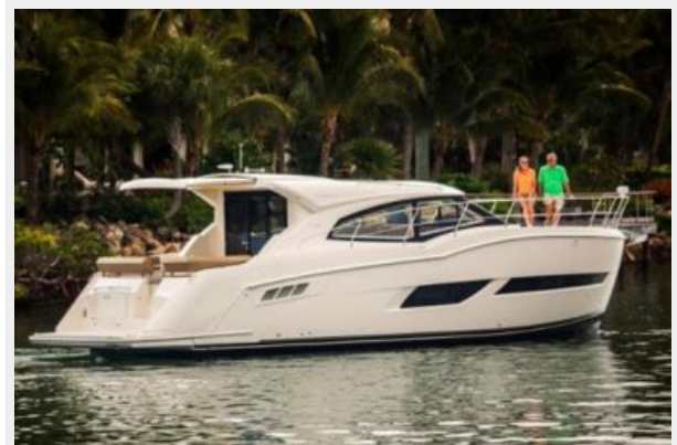
Carver C43 Coupe