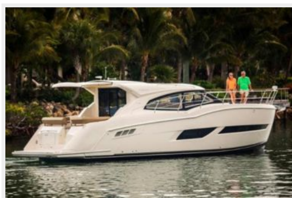
Carver C43 Coupe