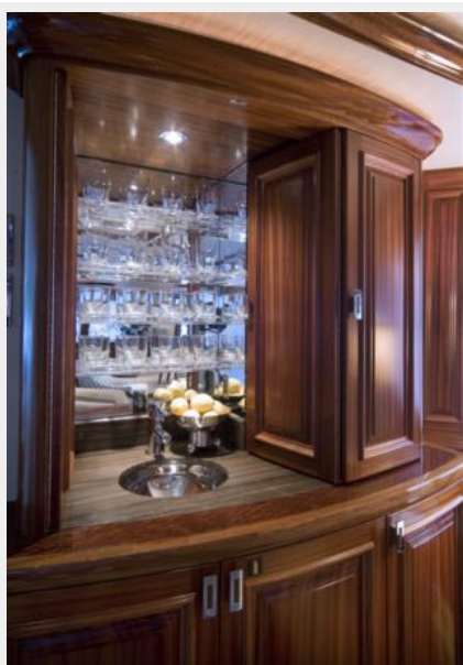
Salon Wet Bar