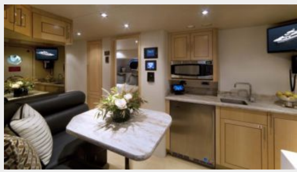
Crew Lounge & Galley