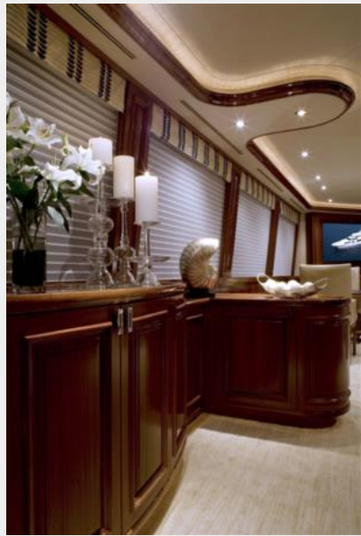
Salon Buffet Area