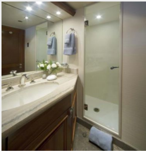
VIP Guest Stateroom #2 Head