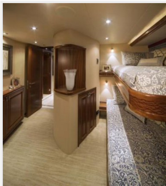
Port Forward Guest Stateroom