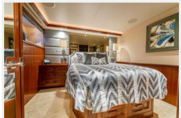
Starboard Aft Guest Stateroom