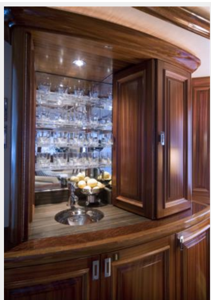
Salon Wet Bar