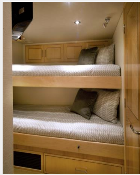
Crew Quarters Starboard