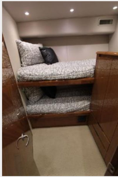
Port Forward Guest Stateroom