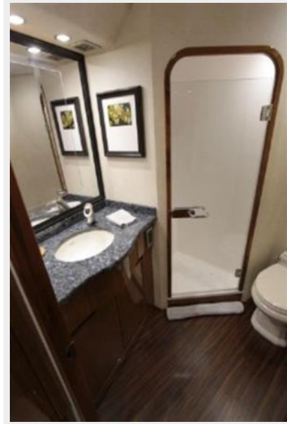
Forward Guest Head