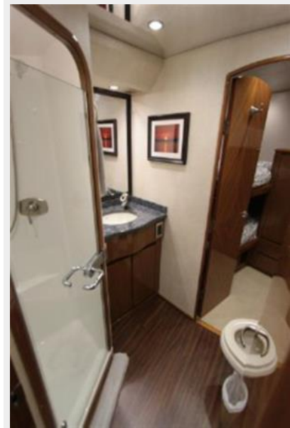
Forward Guest Head