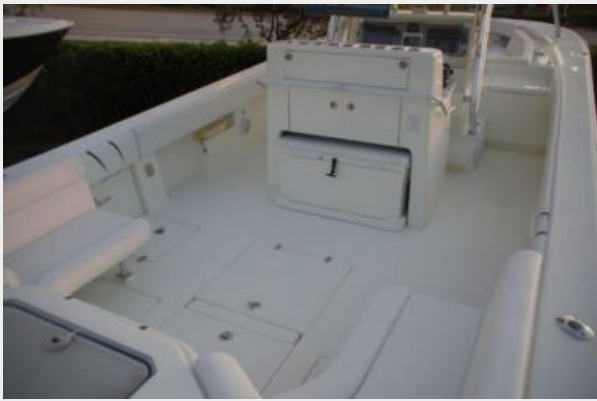
Aft cockpit with lounges onboard