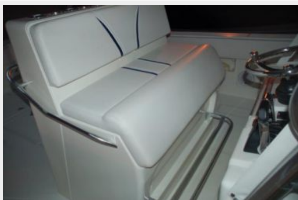
Helm seat and footrest