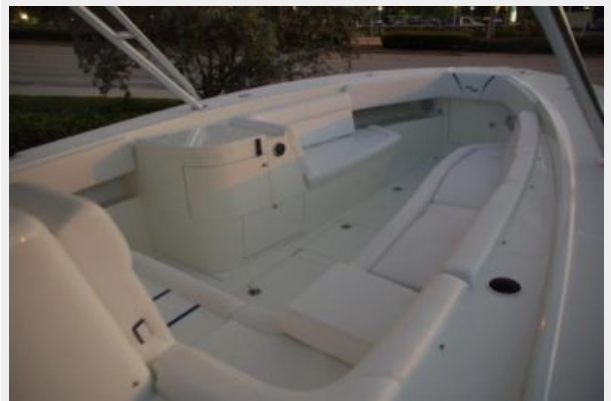
Forward lounge seating