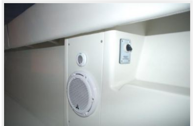
JL Audio speakers throughout