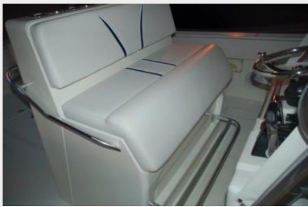
Helm seat and footrest