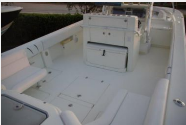
Aft cockpit with lounges onboard