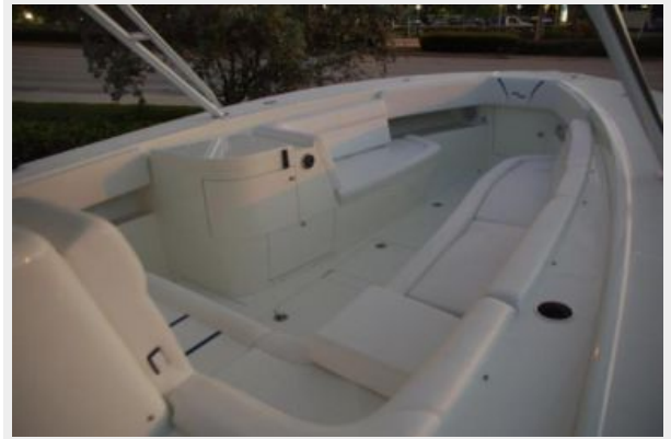
Forward lounge seating