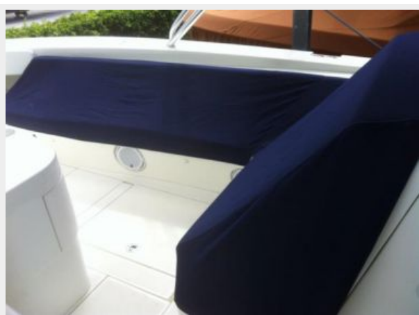
Canvas seat covers