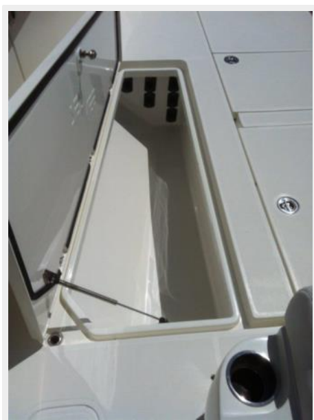
Rod storage underdeck side hatch