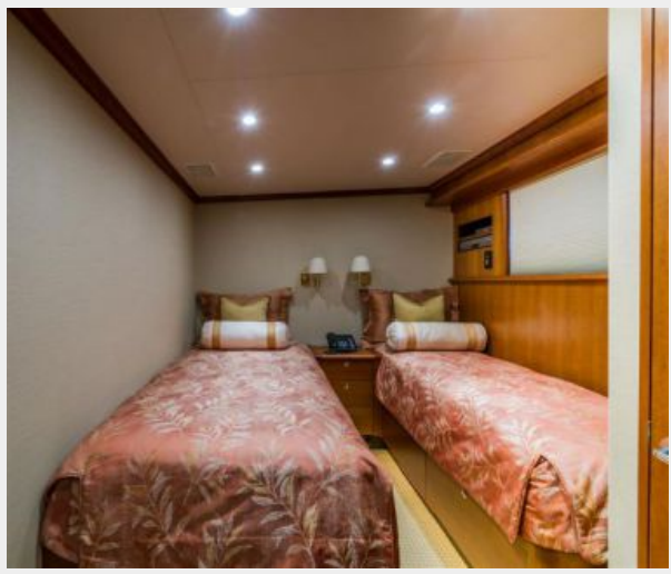
Twin Berth Stateroom