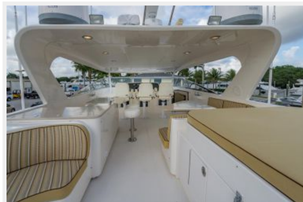
Flybridge Looking Forward