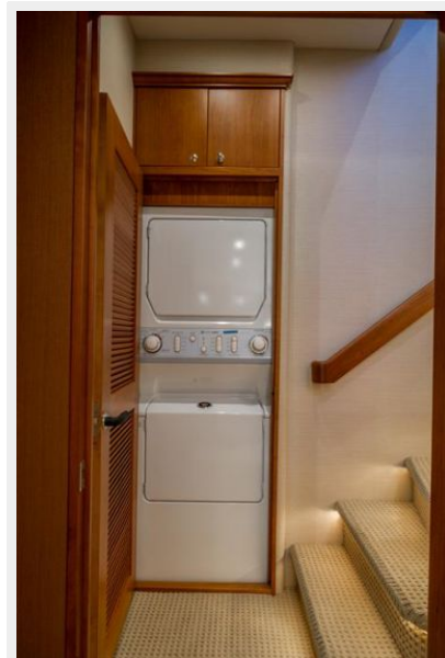
Master Stateroom Laundry