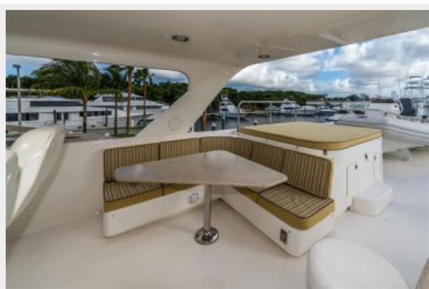
Flybridge Settee/Hot Tub