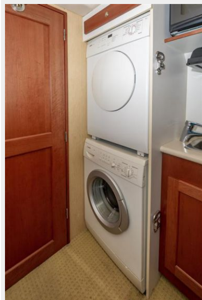
Crew Laundry Area