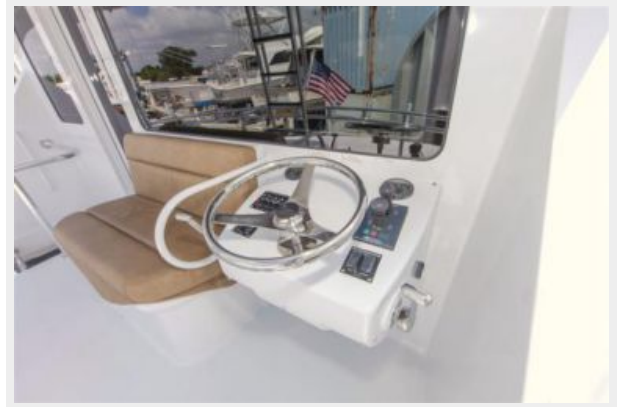
Aft Flybridge Helm