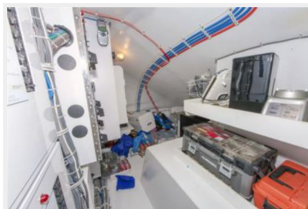
Port Side Utility Room