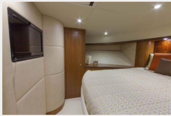
VIP Guest Stateroom