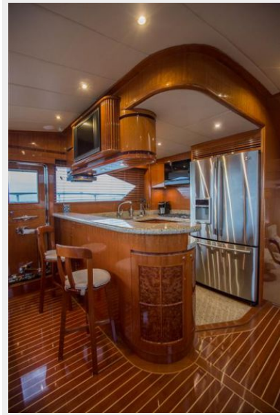
Galley, Breakfast Bar