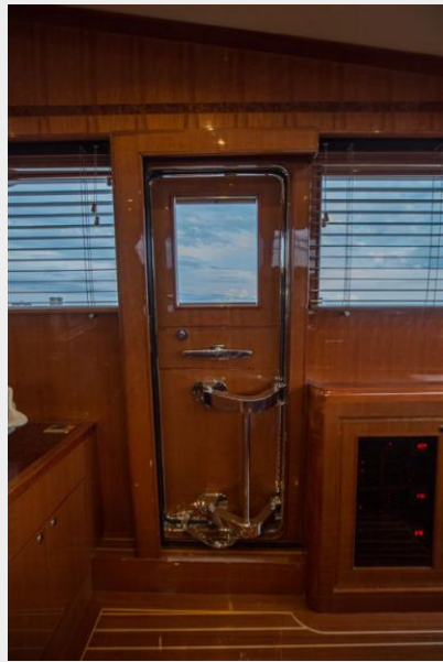
Port Pilothouse Door