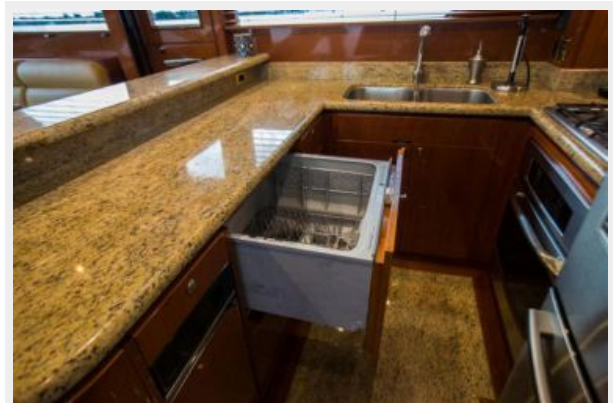
Galley, Pullout Dishwasher