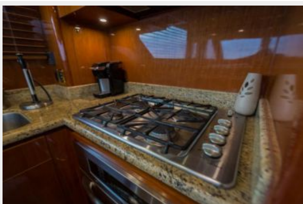
4 Burner Gas Stove