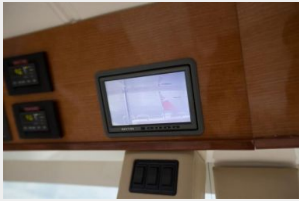
Bridge Video Cameras