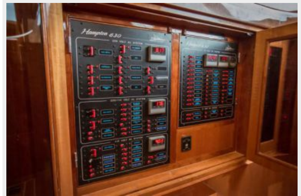
Hampton 63 Electrical Panel, Companionway