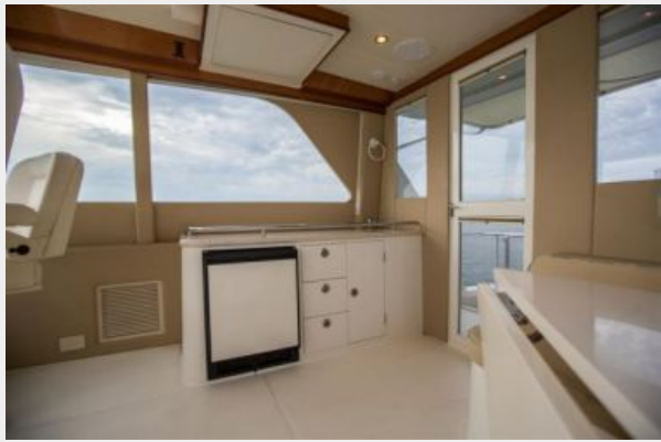
Bridge Electric Fold Down TV