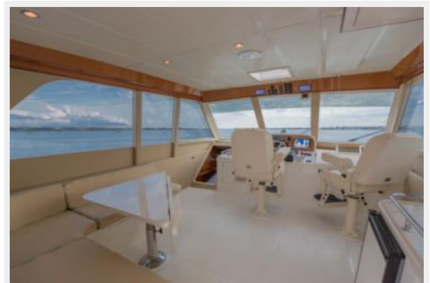
Enclosed Bridge, Electric Window Shutters