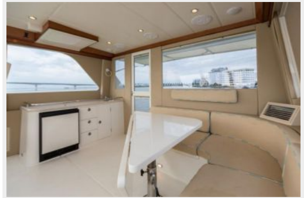
Bridge Wet Bar