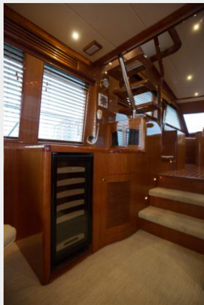
Salon Built In Wine Cooler