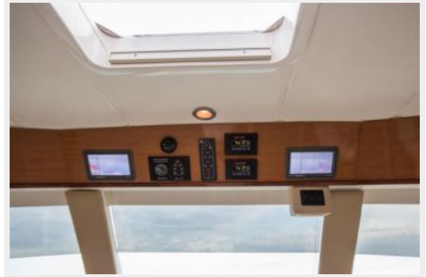
Bridge Hatch, Bridge Video