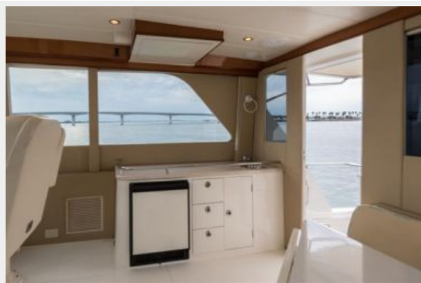
Bridge Door to Aft Deck