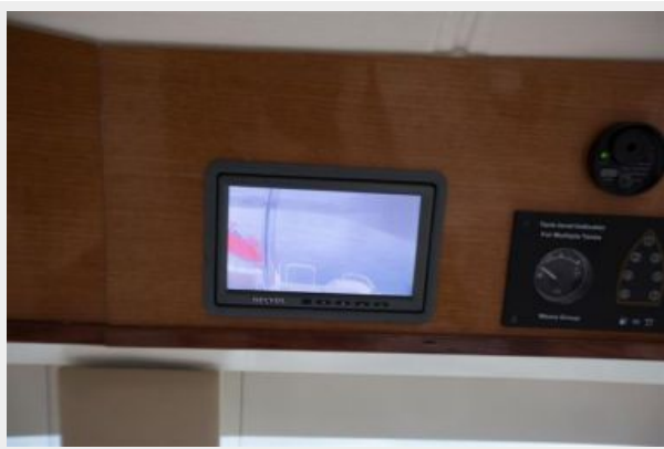
Bridge Video Cameras