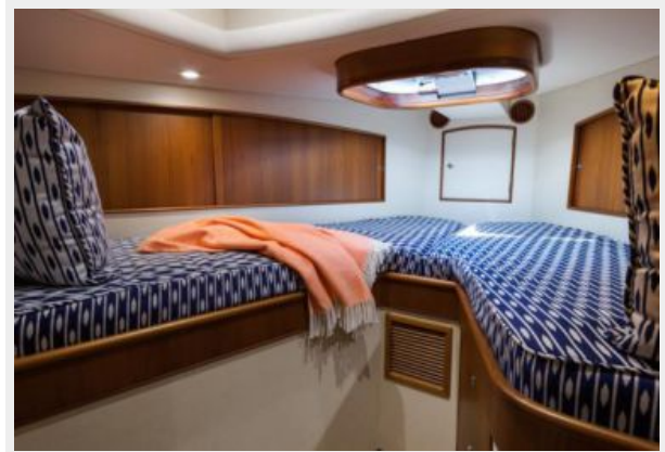
VIP Forward Stateroom