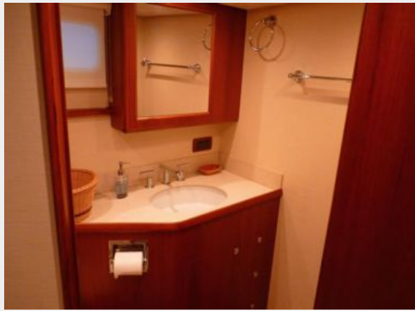
VIP Forward Stateroom