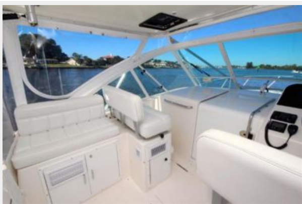
Helm Deck Port