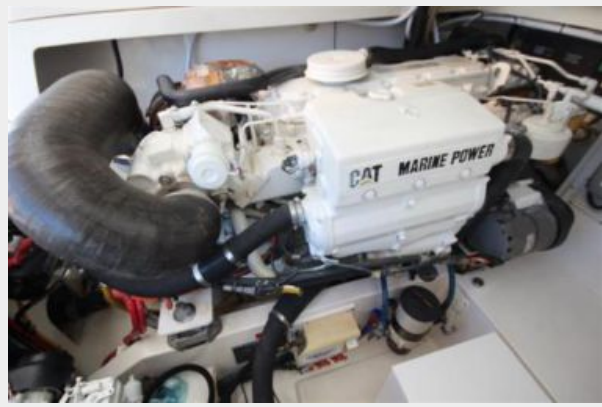
Port Engine 2