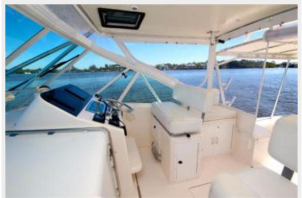
Helm Deck Starboard 2