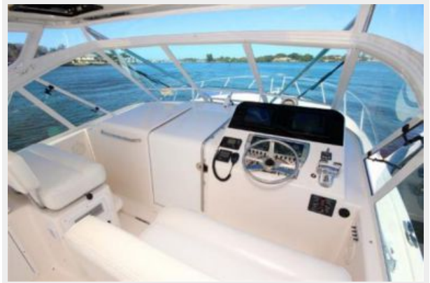
Helm Deck Overview