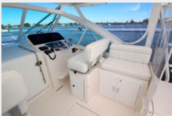
Helm Deck Starboard