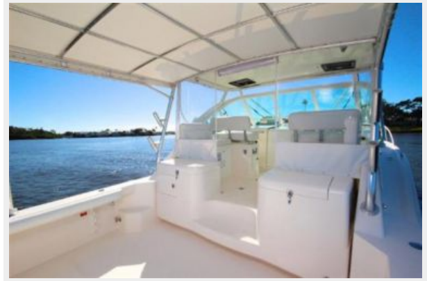
Cockpit Overview 2