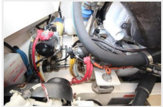
Port Marine Gear