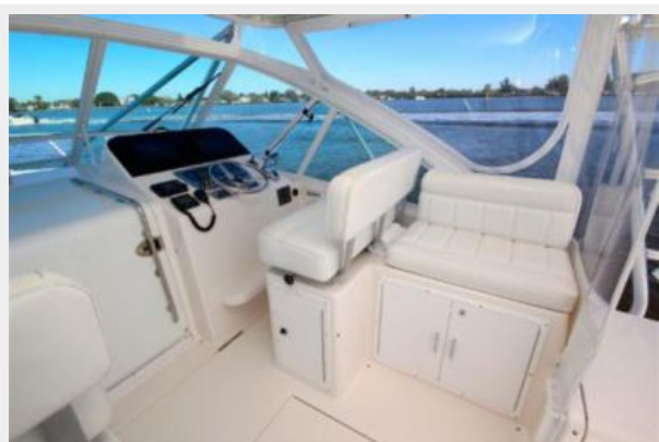
Helm Deck Starboard