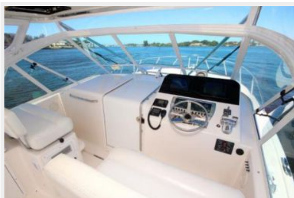
Helm Deck Overview