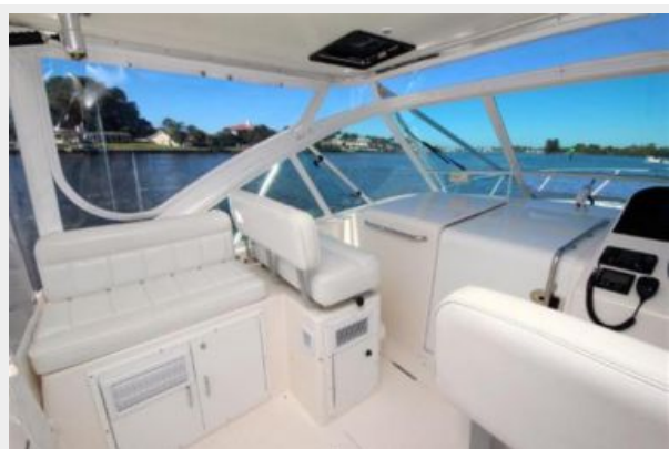
Helm Deck Port