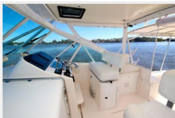
Helm Deck Starboard 2