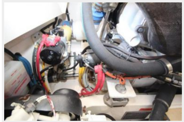
Port Marine Gear