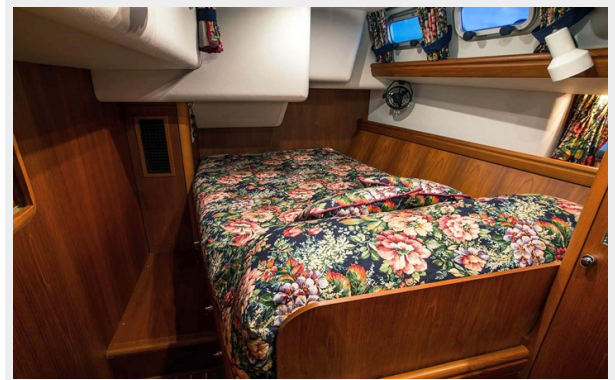
Guest Double, Port Aft