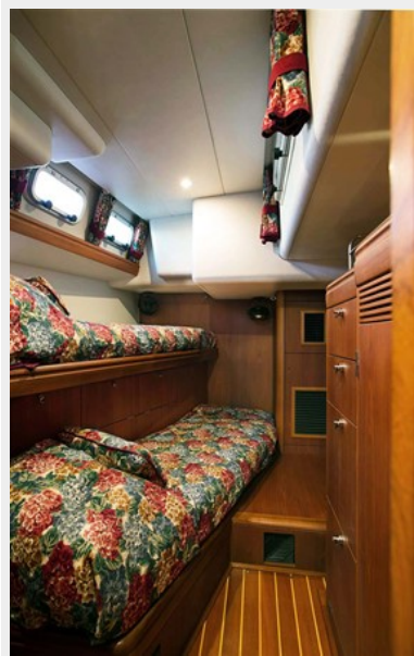
Guest Twin, Stbd. Aft