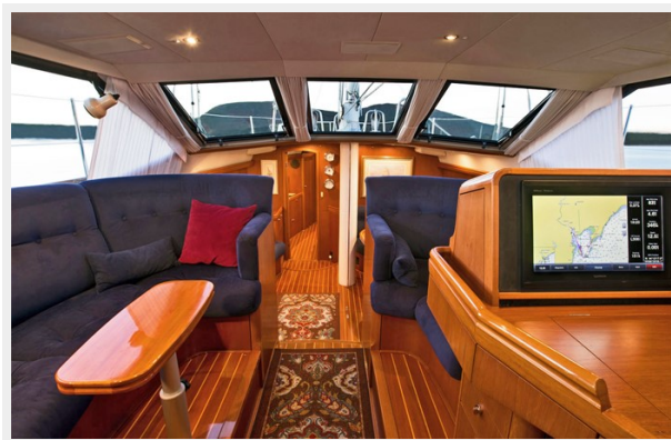
Upper Salon with Nav Area and Protected Watch Station