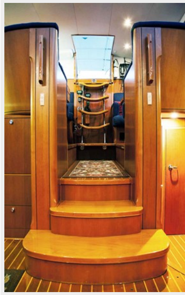
Companionway and Salon Steps