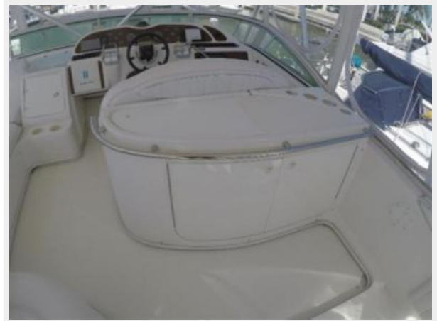
Bridge serving area