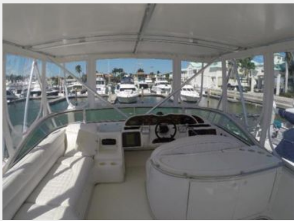
Large forward bridge