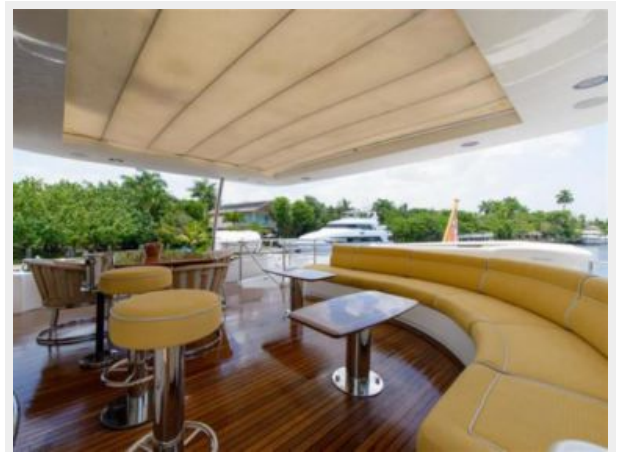
Aft Upper Deck