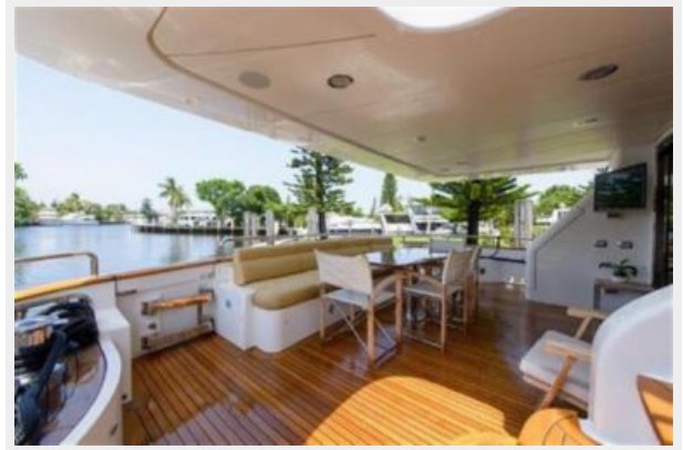
Aft Main Deck