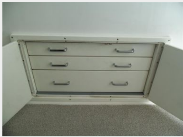
Helm Deck Tackle Center