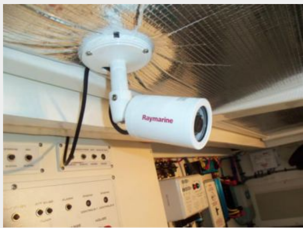
Engine Room Camera