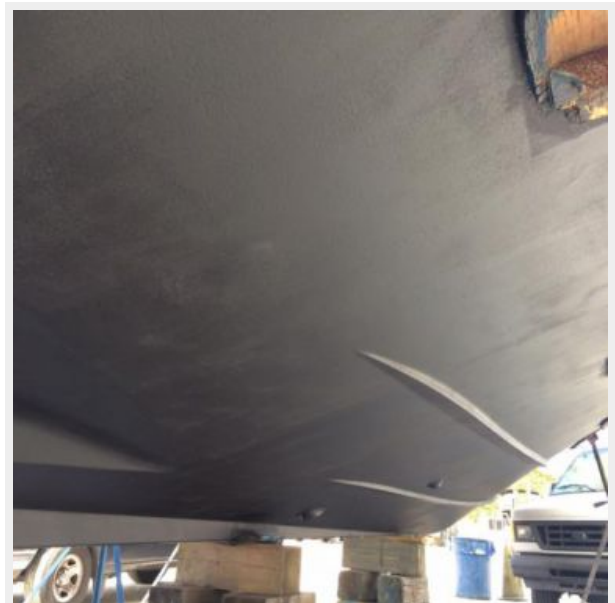
Blister Free Bottom