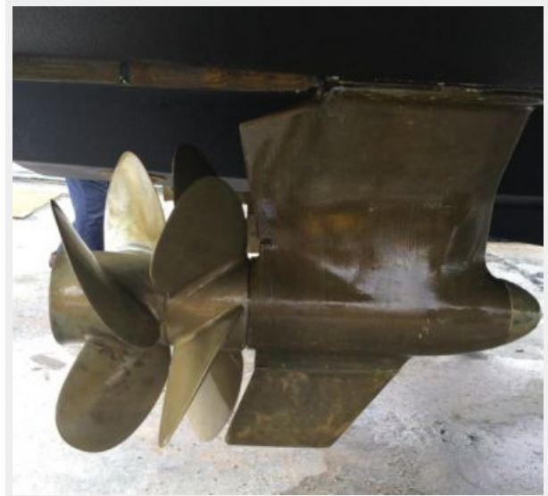
Prop Speed on Zeus drive