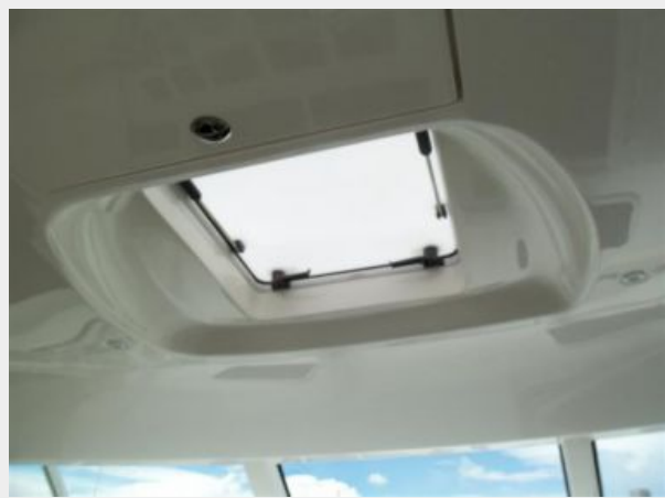
Helm Deck Vent Hatch