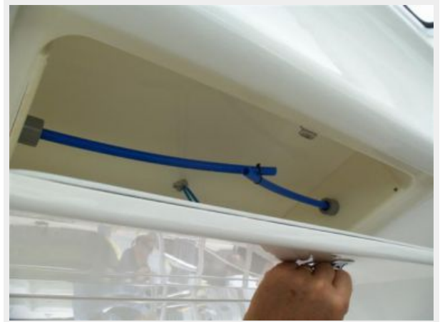
Ready for Teaser Reels