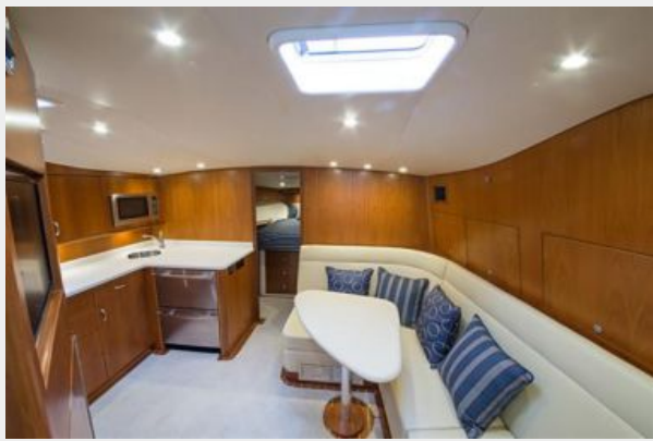
Main Cabin Looking Forward