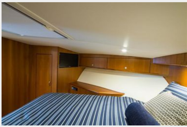
Master Cabin Looking Starboard