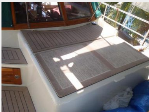
Fore deck seating/storage