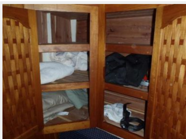
Forward Cabin cabinets