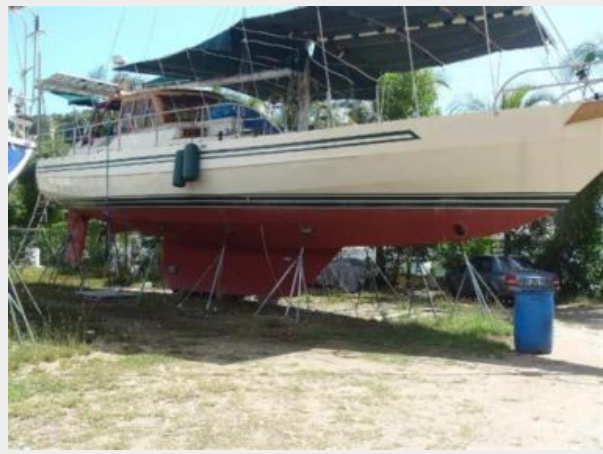
Out of the water