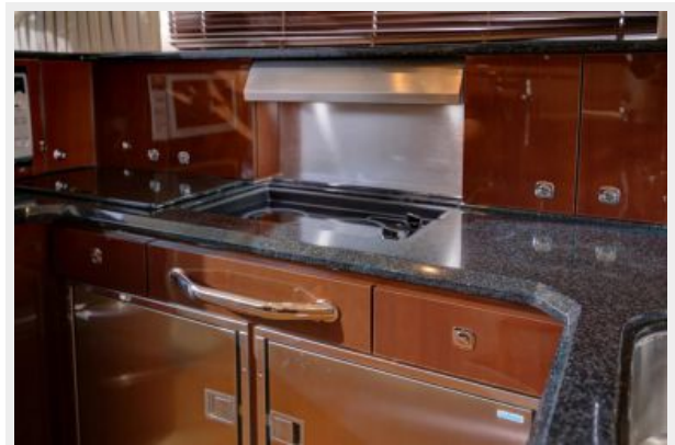
Galley Mystic Black Counter Top / Solid Surface Stove Top