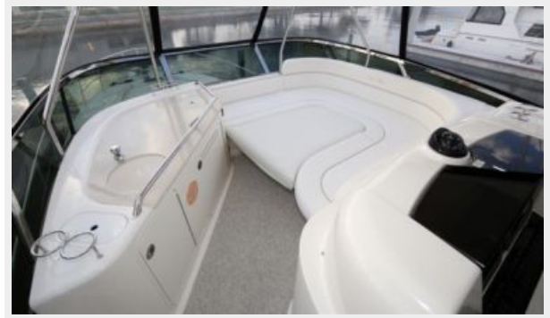
Forward Bridge Seating w/ Seat