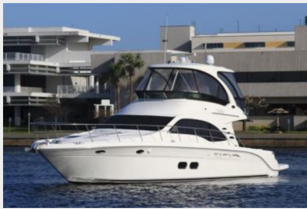
Port Bow Profile