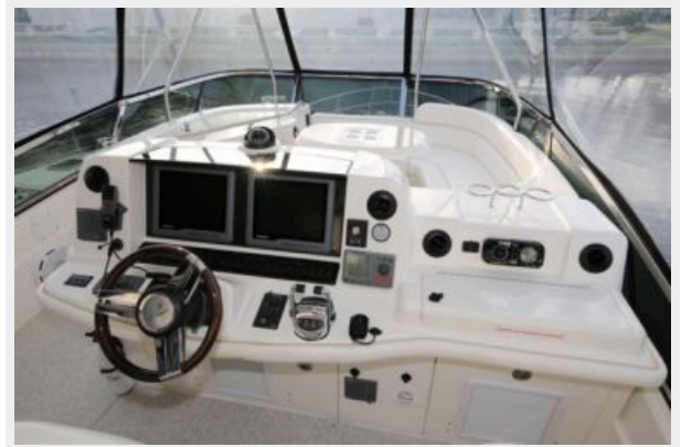
Helm Electronics (4)