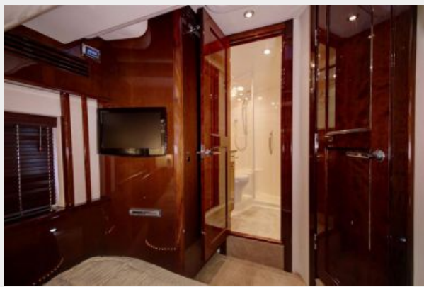
Master Stateroom w / Head