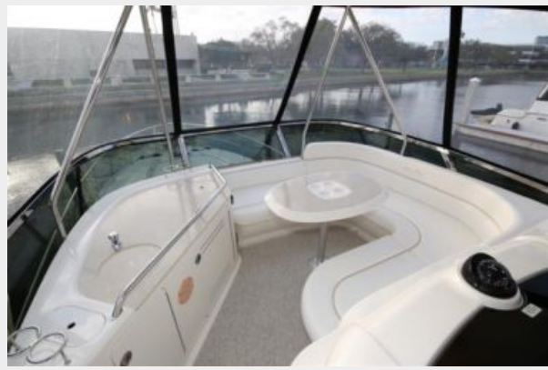
Forward Bridge Seating