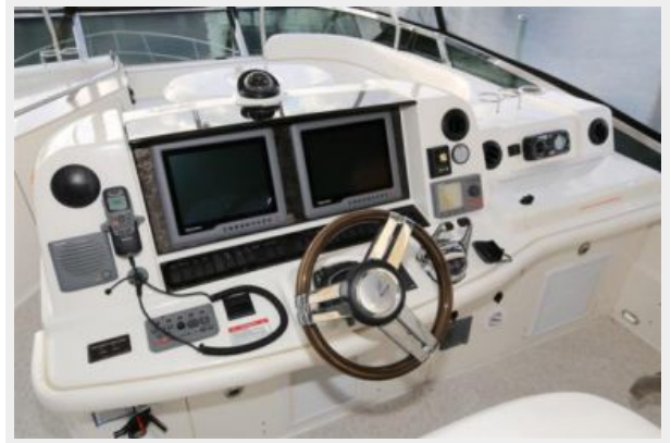
Helm Electronics (2)