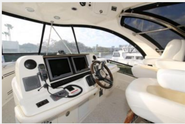
Helm Electronics (3)