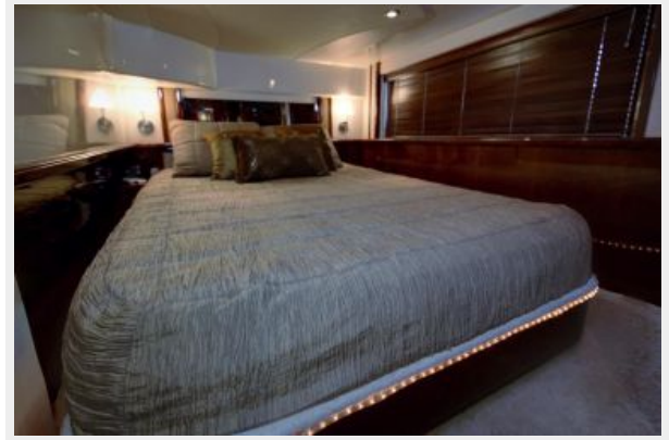
Master Stateroom (2)