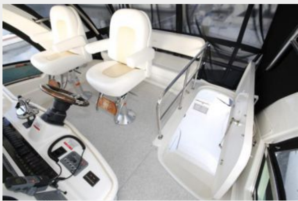
Twin Helm Chairs