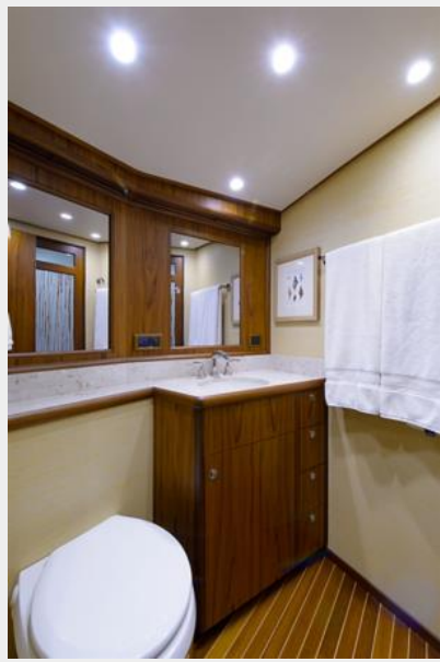
Port Guest Head