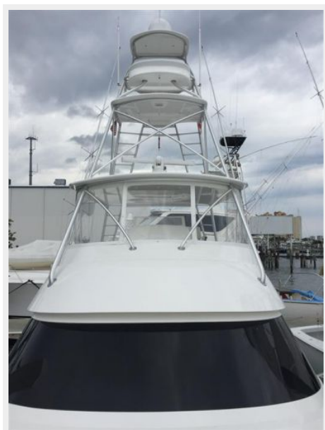
Tuna Tower 1