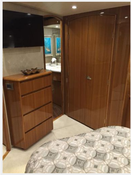
Master Stateroom, 3