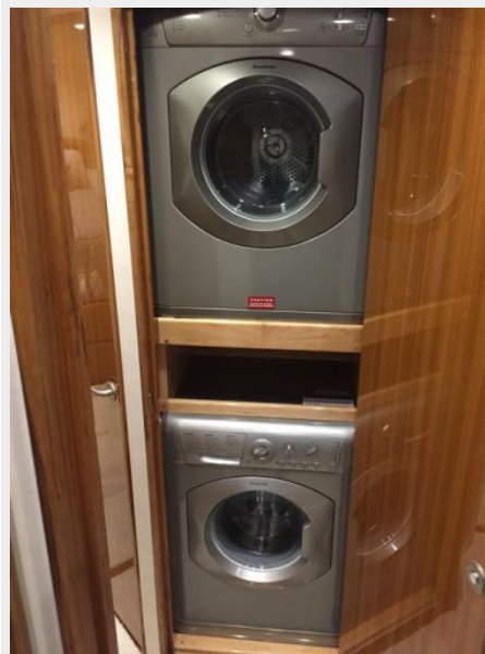
Companionway 2 - Stackable Washer & Dryer