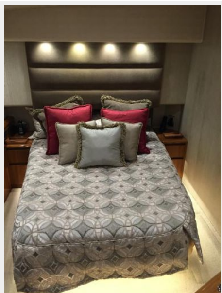
Master Stateroom, 1