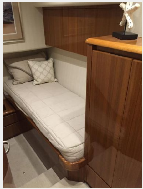
Guest Stateroom, Port 2