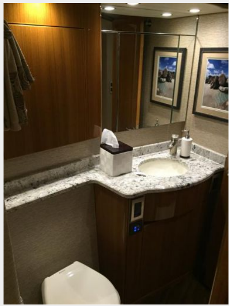
Guest Head 1