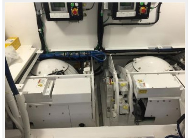
(2) SeaKeeper Gyros