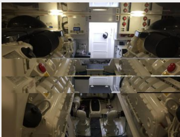
Engine & Mechanical Equipment 2