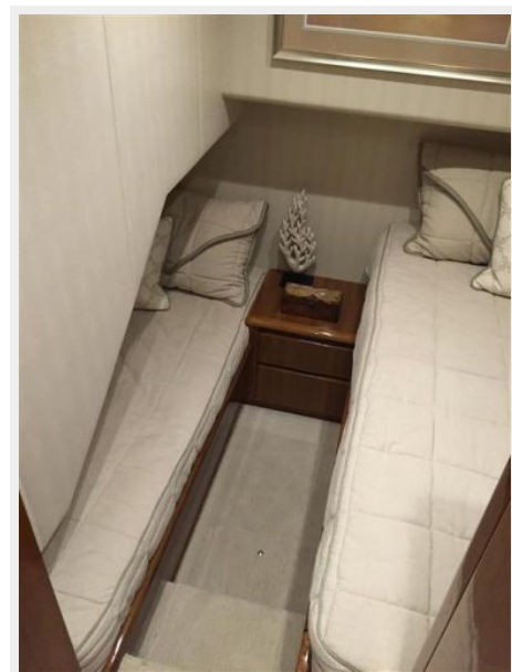
Guest Stateroom, Port 1