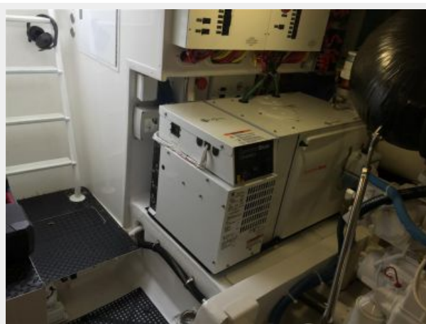
Electrical Equipment - Onan Generator #1