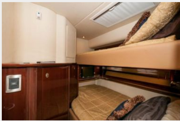
VIP Guest Stateroom