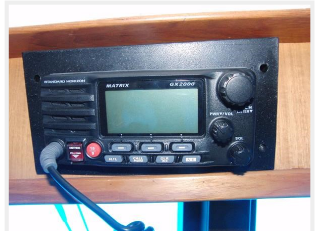
VHF radio #2