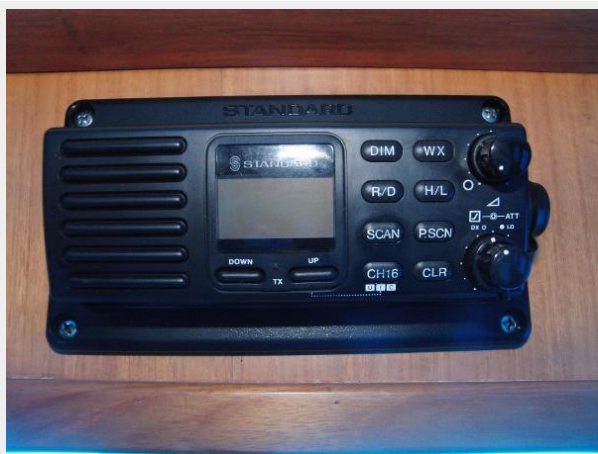
VHF radio #1