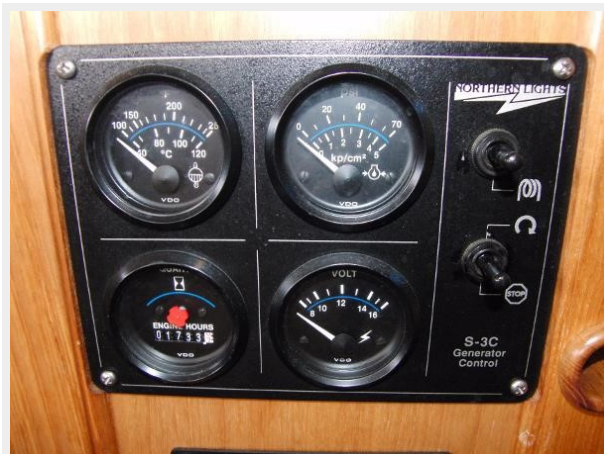
Hurricane hydronic heat system