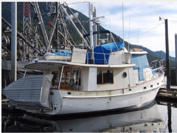
Starboard view aft