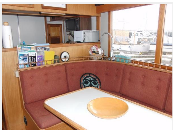
Salon seating foreward