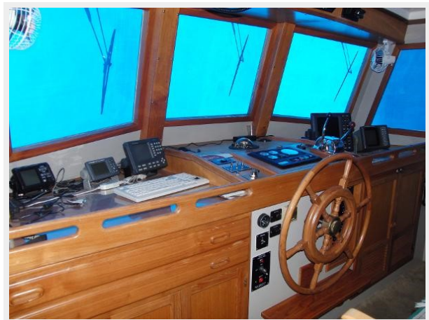
Instrument Panel with Hour Meter