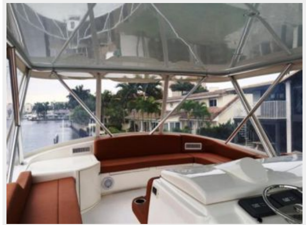
Bridge Custom Hardtop