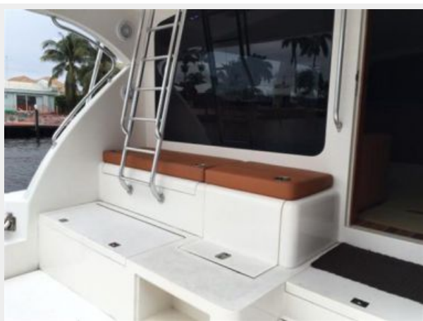
Port Cockpit Mezzanine Seating