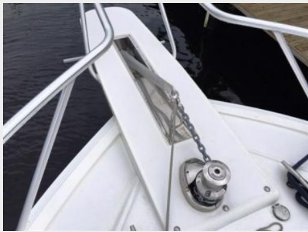
Anchor Windlass Platform