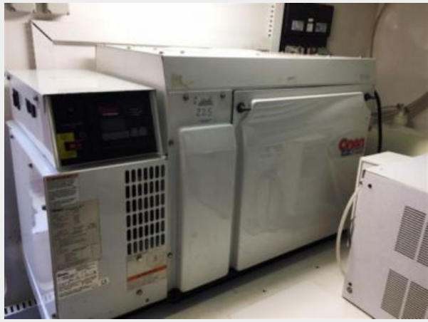
1 of 2 Onan Gen Sets