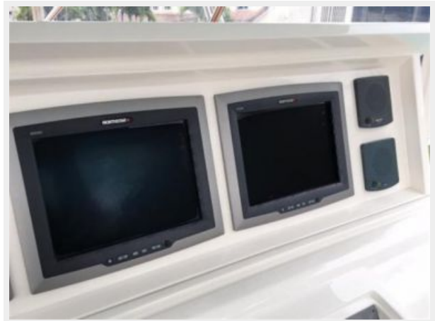
Northstar 8000i units