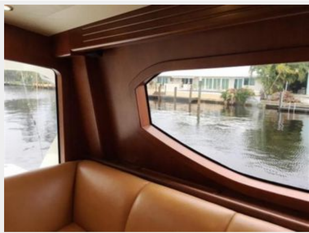
Salon Port Windows