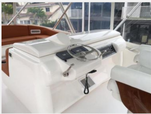
Bridge Console retracted