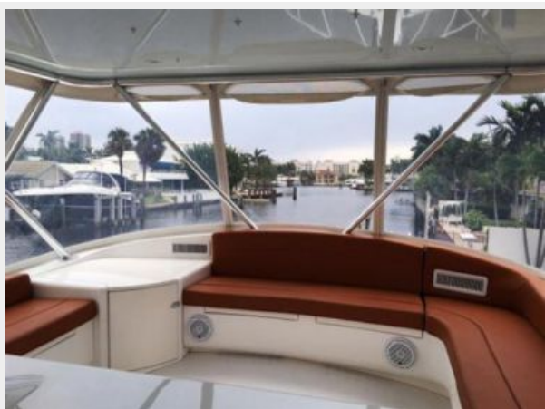
Bridge more seating