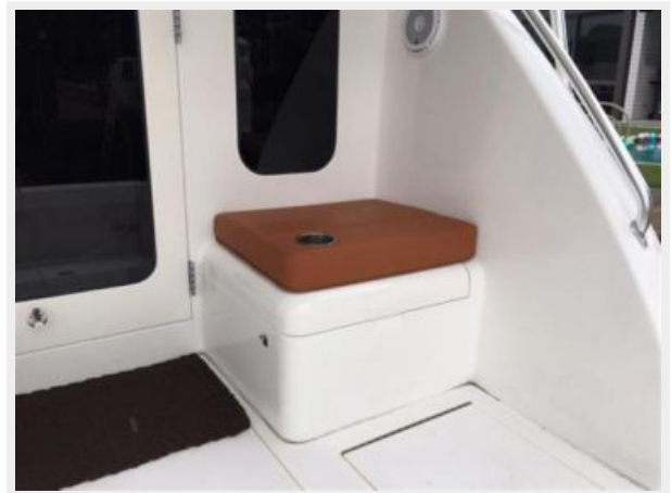
Starboard Cockpit Salon Entry