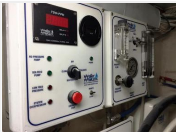
Water Maker 1