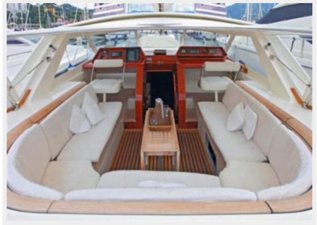
Outside dining area