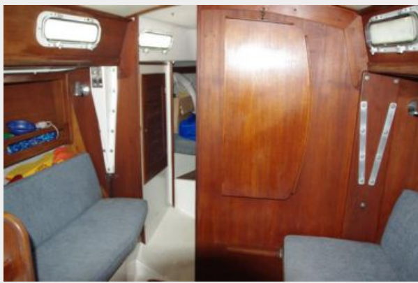
Forward bulkhead and table folded up