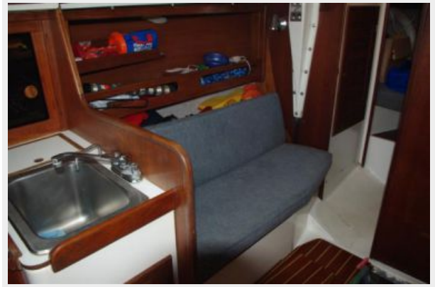
Port settee & sink