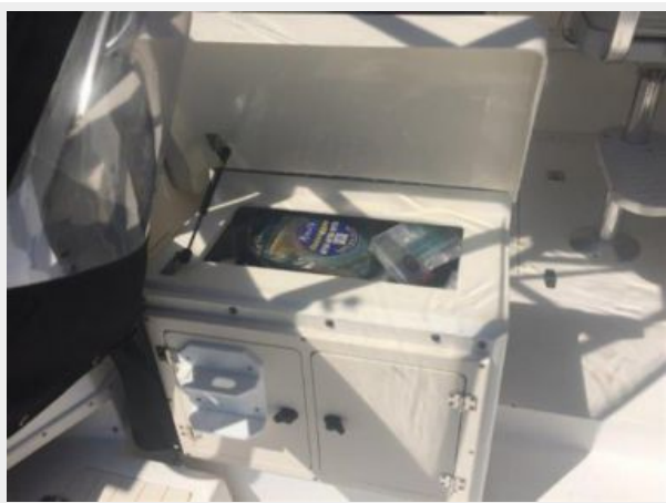
Cockpit Tackle Storage