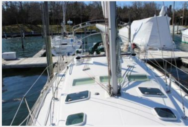
Captain Jack Approved!