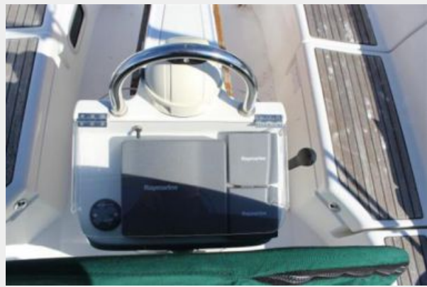
Electronics Pod - Helm