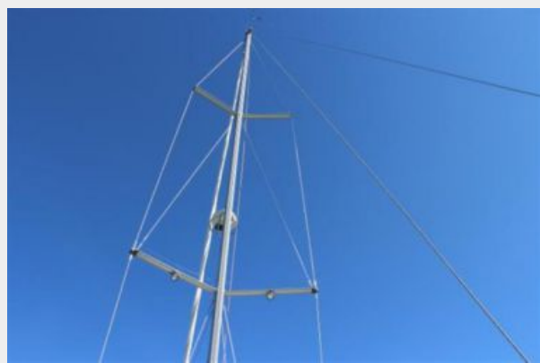
Double Spreader Rig