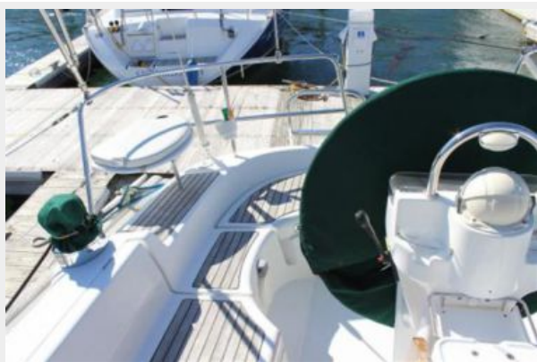
Cockpit - 2