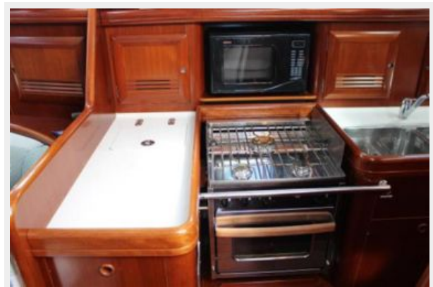
Galley - 2