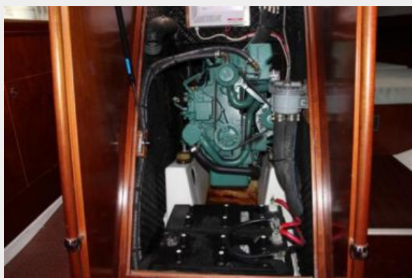
Engine Compartment 2