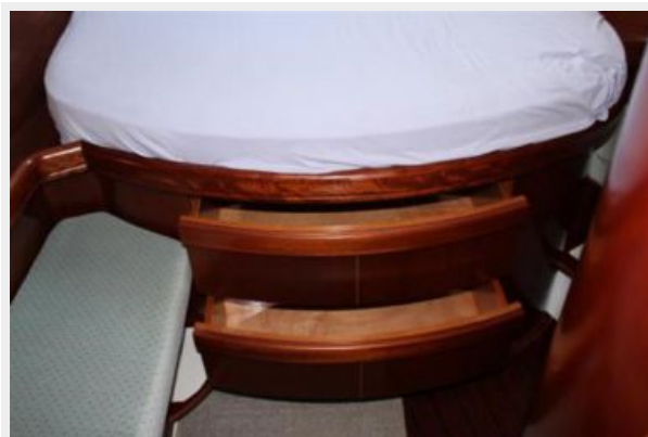
Under Bunk Storage - Master