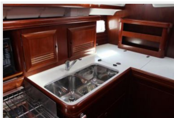
Galley - 3