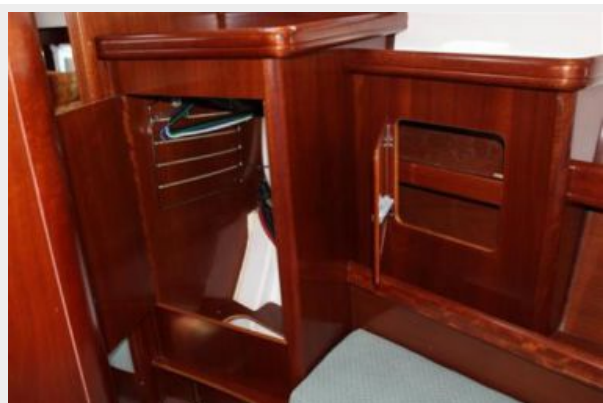
Hanging Locker 2 - Master