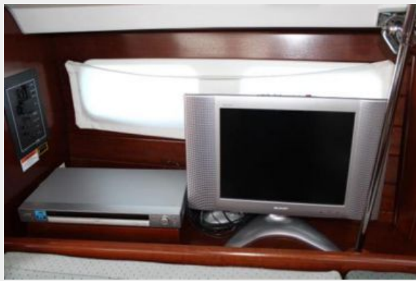
Salon TV/ DVD