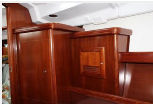
Hanging Locker - Master Stateroom