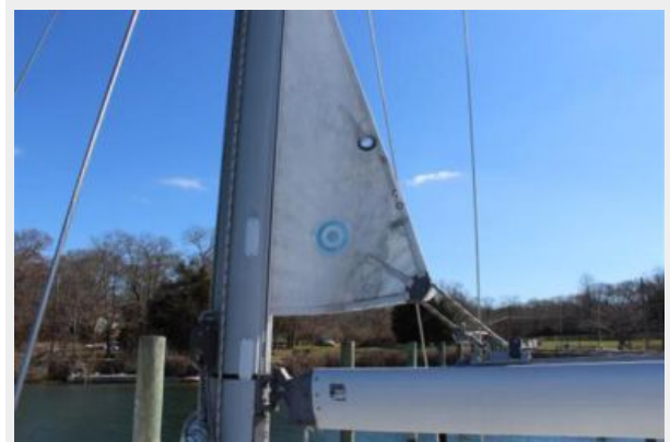
Main Sail In-Mast furling system