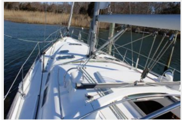
Forward Deck Space