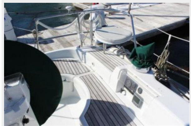
Cockpit - 1