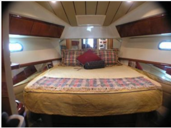
Master Stateroom Forward