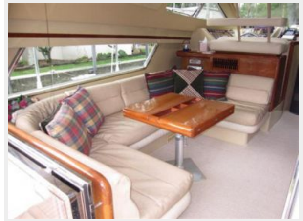
Main Salon Port Couch