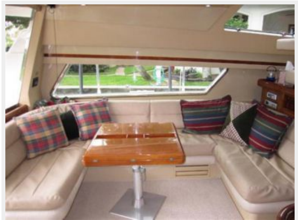
Main Salon Couch