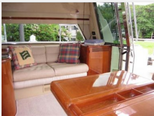
Main Salon Starboard