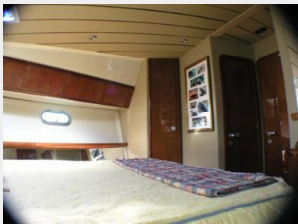
Master Stateroom Closet