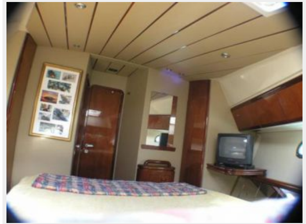
Master Stateroom Private Ensuite Head