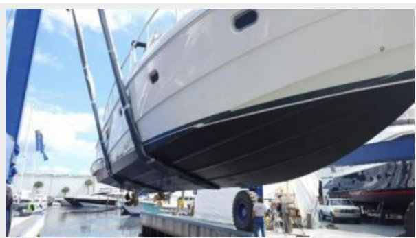
Starboard Bottom Job