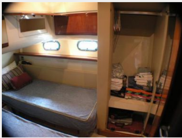
Port Twin Stateroom Closet