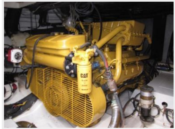
Port CAT 3208