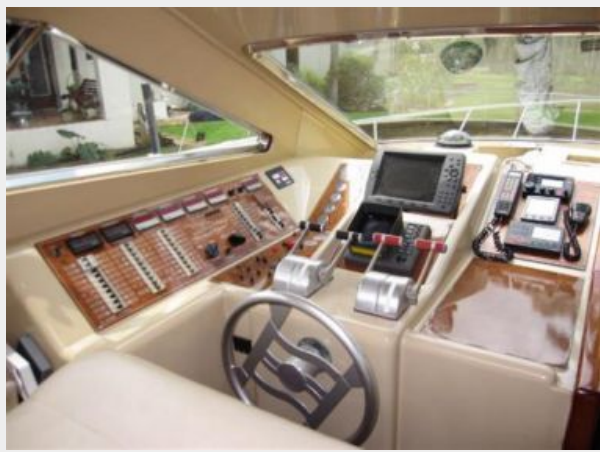
Lower Helm Station