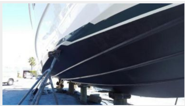
Starboard Bottom Job