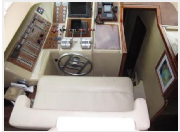
Lower Helm Station Access from Flybridge