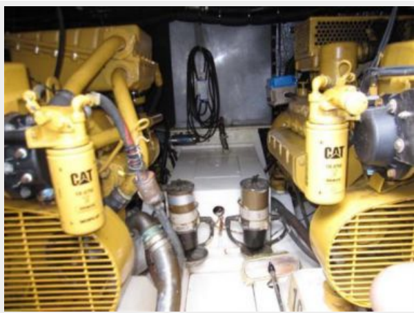
Engine Room Forward