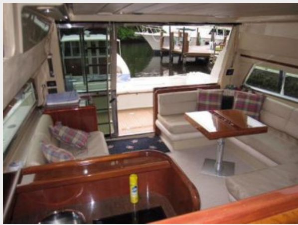
Main Salon Aft