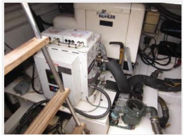
8kw Kohler Generator and Air Conditioning