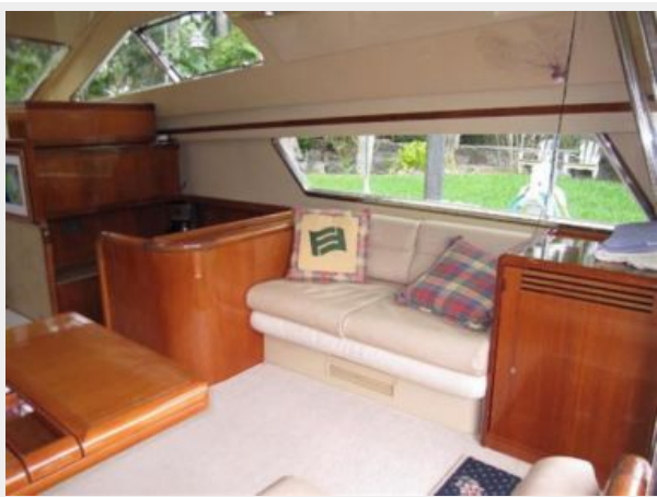
Main Salon Love Seat