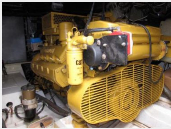
Starboard CAT 3208