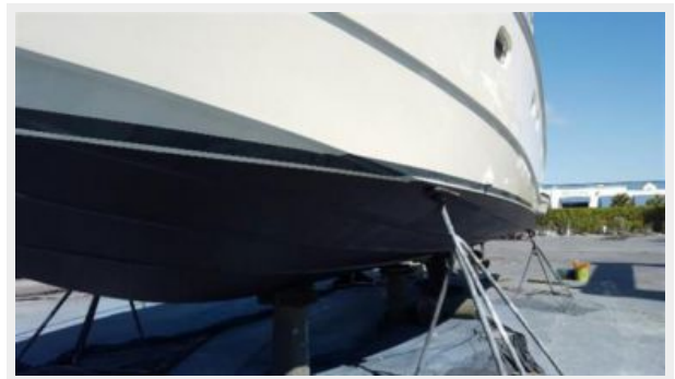
Port Bottom Job