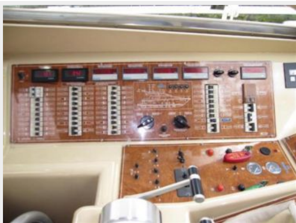
AC/DC Distribution Panel