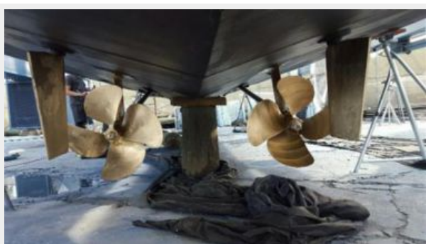
Running Gear Reconditioned