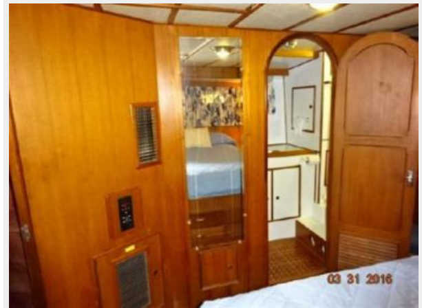
50' Marine Trader VIP guest stateroom starboard