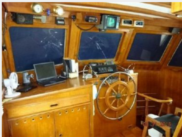
50' Marine Trader pilothouse