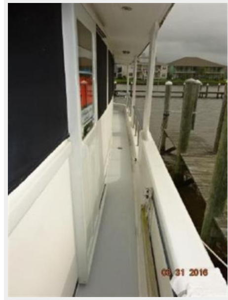
50' Marine Trader port side deck photo1