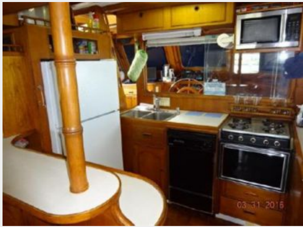
50' Marine Trader galley photo1