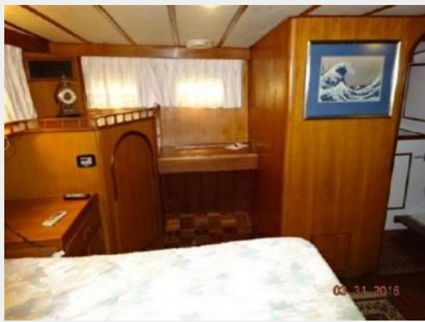
50' Marine Trader master stateroom port