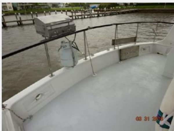
50' Marine Trader aftdeck photo1