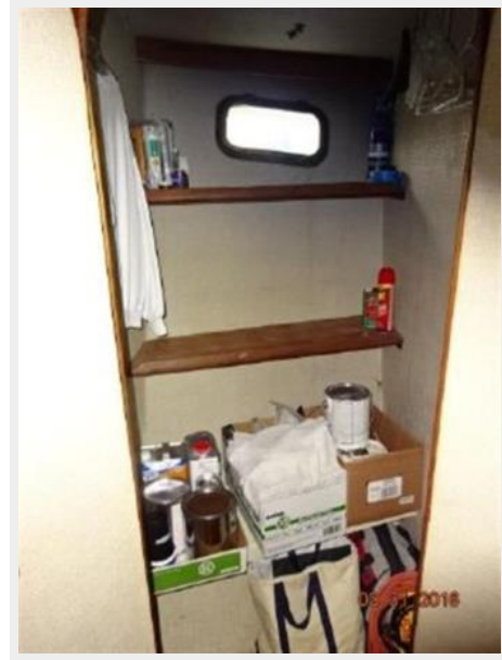
50' Marine Trader forward storage locker