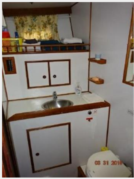
50' Marine Trader forward guest stateroom head