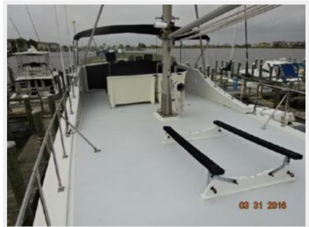
50' Marine Trader flybridge forward