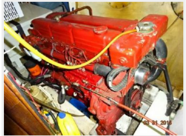
50' Marine Trader port main engine