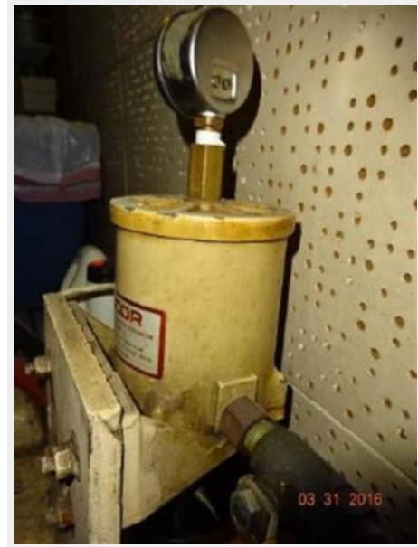
50' Marine Trader starboard Racor fuel filter