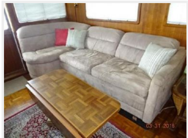
50' Marine Trader salon port seating