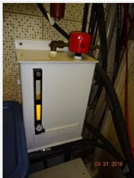
50' Marine Trader stabilizer system