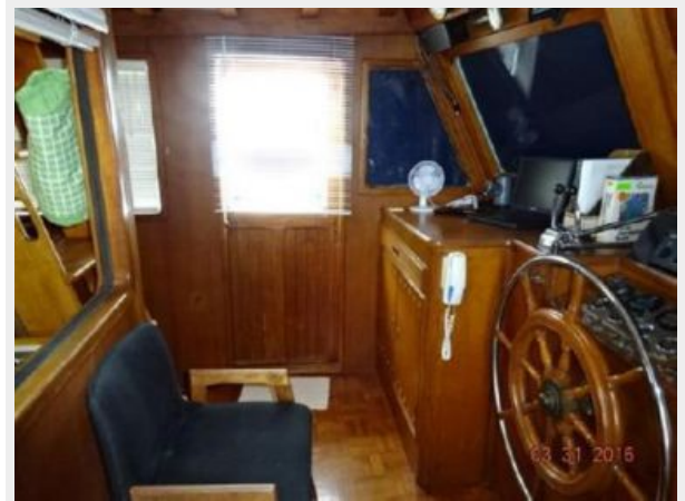
50' Marine Trader pilothouse port