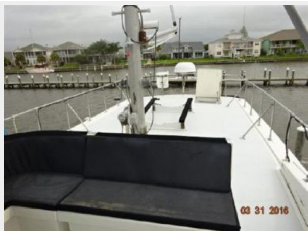
50' Marine Trader flybridge aft