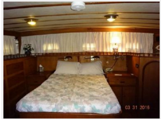
50' Marine Trader master stateroom