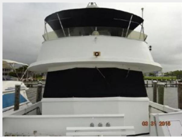
50' Marine Trader foredeck aft