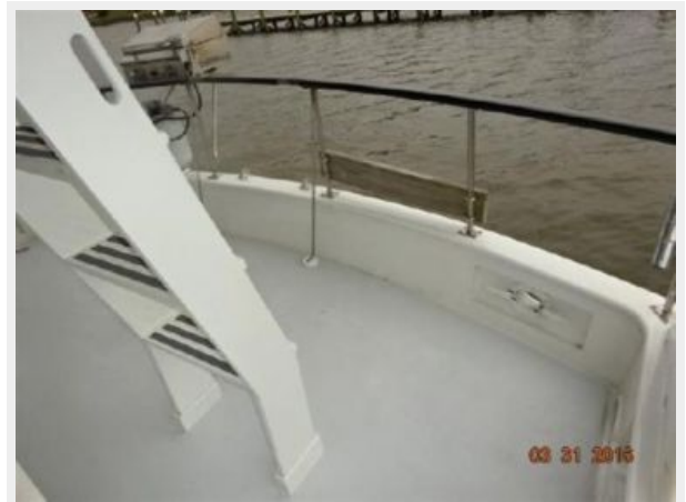
50' Marine Trader aftdeck photo2