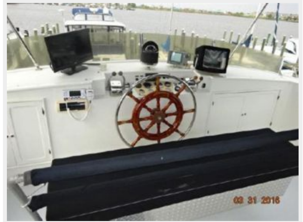
50' Marine Trader flybridge helm