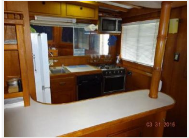
50' Marine Trader galley photo2