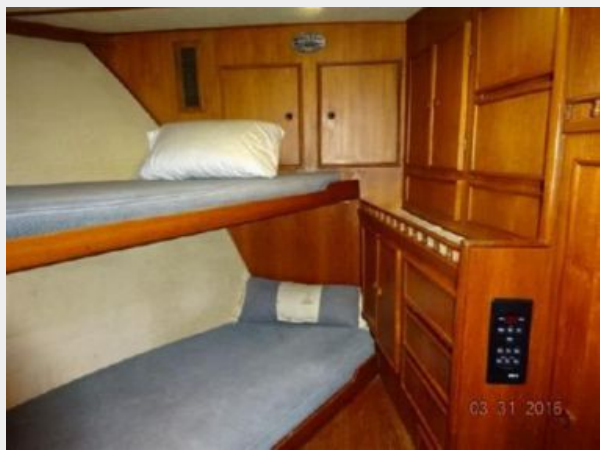
50' Marine Trader forward guest stateroom