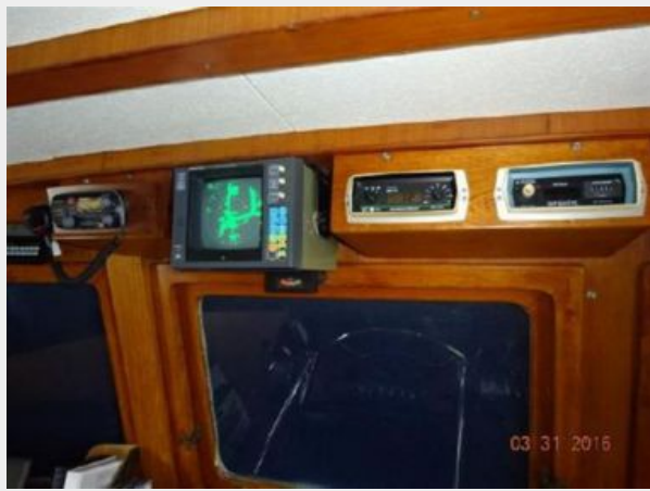
50' Marine Trader pilothouse electronics