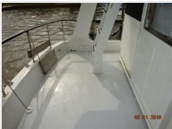
50' Marine Trader aftdeck port