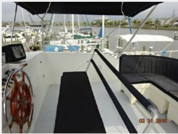
50' Marine Trader flybridge starboard