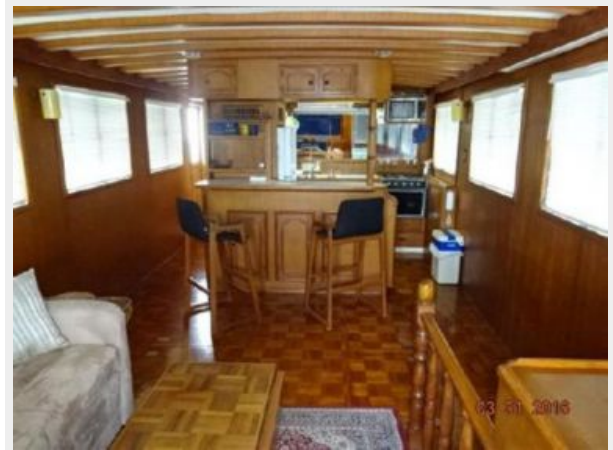
50' Marine Trader salon forward