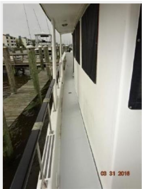
50' Marine Trader port side deck photo2