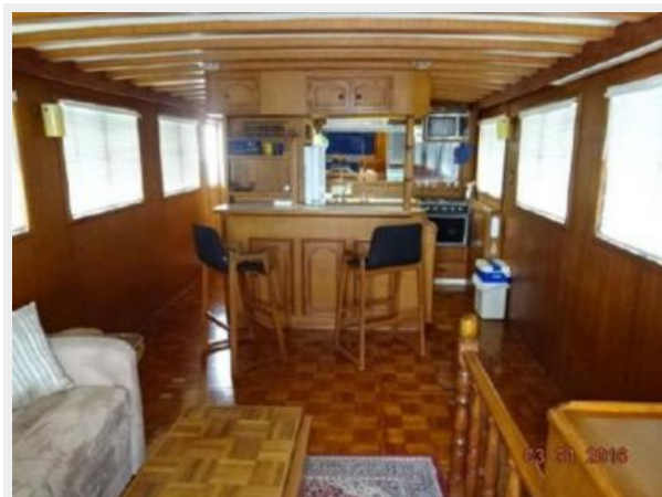
50' Marine Trader salon forward