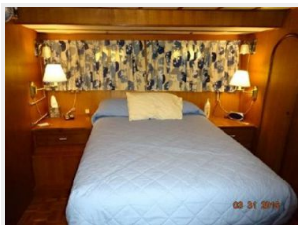
50' Marine Trader VIP guest stateroom port