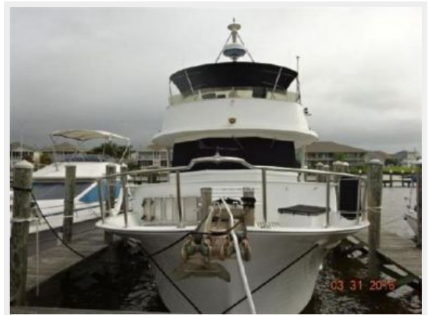
50' Marine Trader forward profile