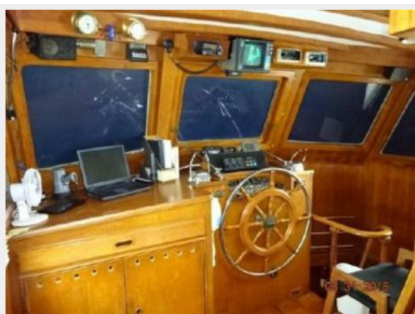
50' Marine Trader pilothouse