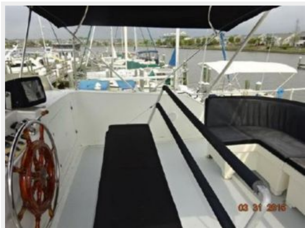
50' Marine Trader flybridge starboard