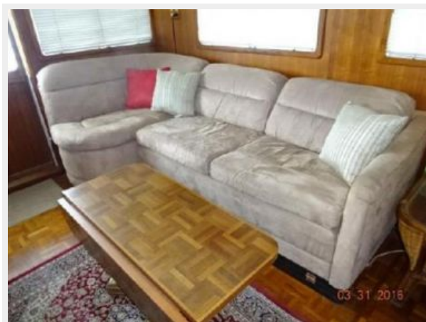
50' Marine Trader salon port seating