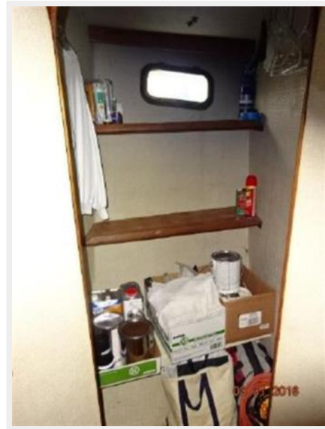
50' Marine Trader forward storage locker