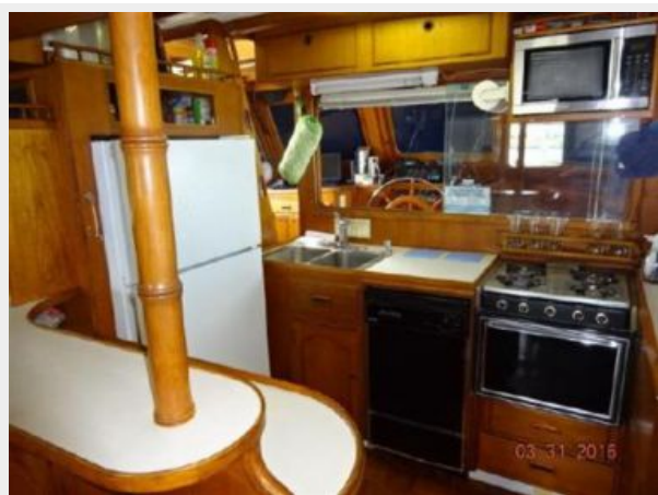
50' Marine Trader galley photo1