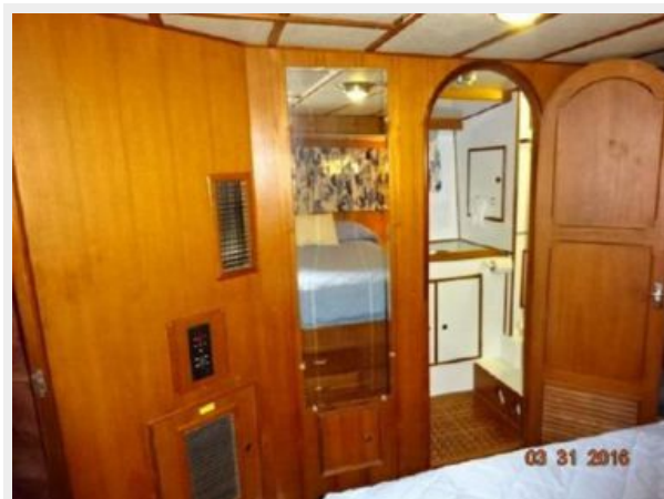
50' Marine Trader VIP guest stateroom starboard