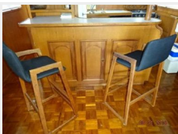
50' Marine Trader salon bar