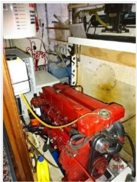
50' Marine Trader port engine room aft