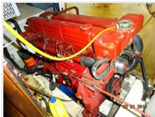
50' Marine Trader port main engine