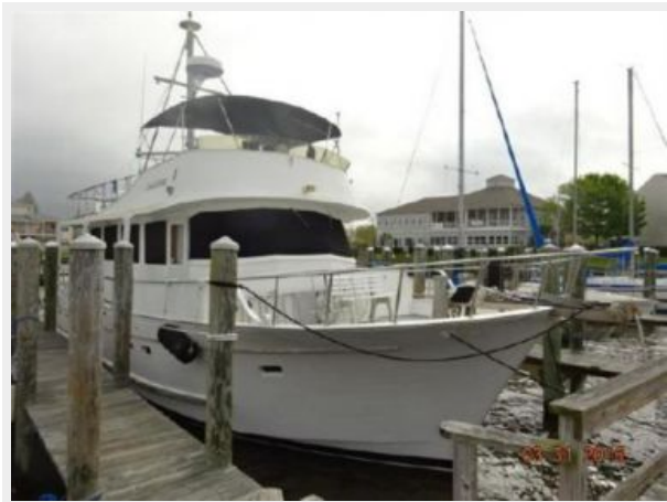
50' Marine Trader starboard forward profile