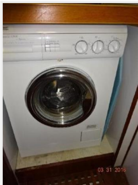
50' Marine Trader washer-dryer