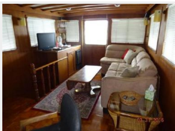
50' Marine Trader salon aft