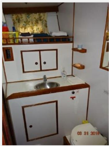
50' Marine Trader forward guest stateroom head