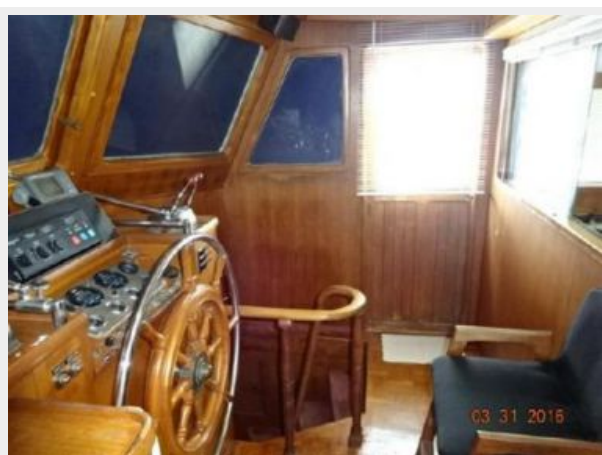
50' Marine Trader pilothouse starboard