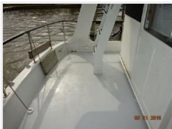
50' Marine Trader aftdeck port