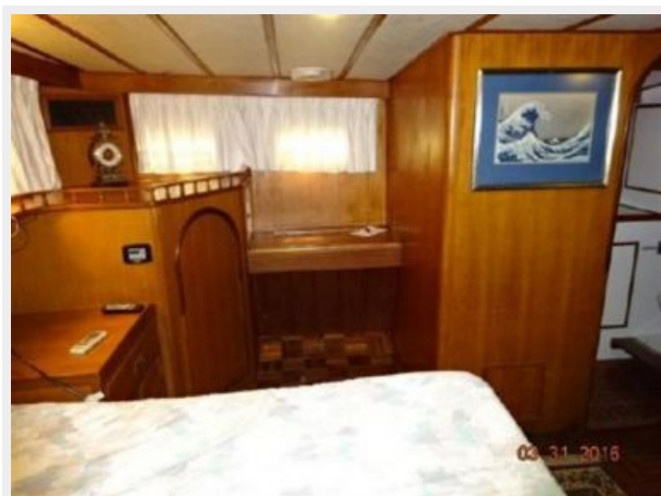
50' Marine Trader master stateroom port