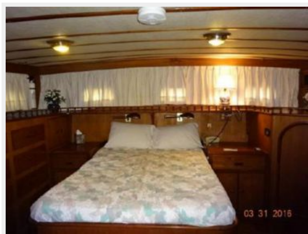
50' Marine Trader master stateroom