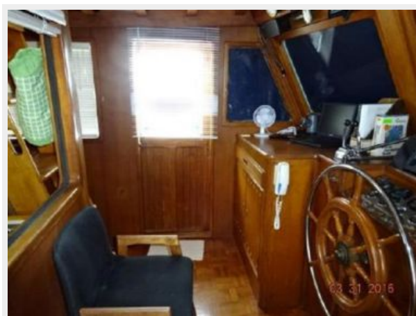
50' Marine Trader pilothouse port