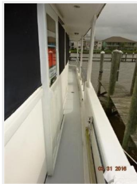
50' Marine Trader port side deck photo1