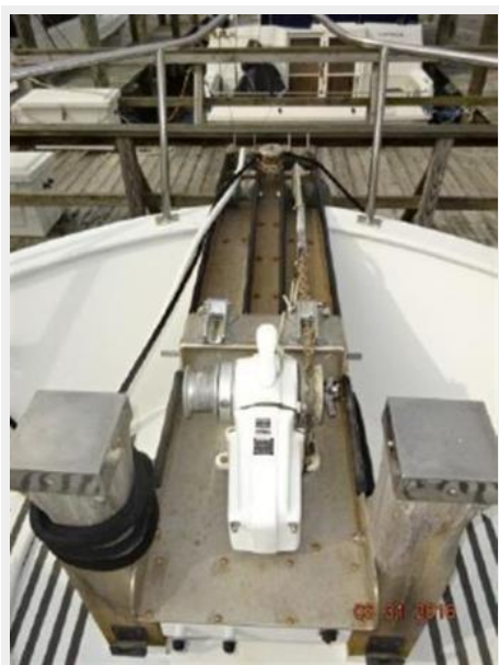
50' Marine Trader anchor windlass