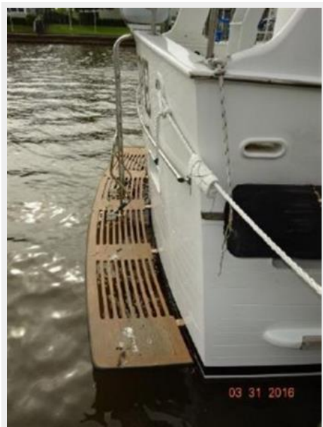
50' Marine trader swimplatform