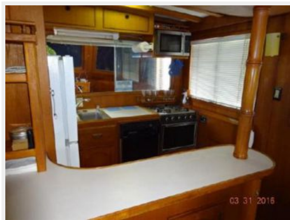
50' Marine Trader galley photo2