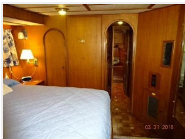
50' Marine Trader VIP guest stateroom forward