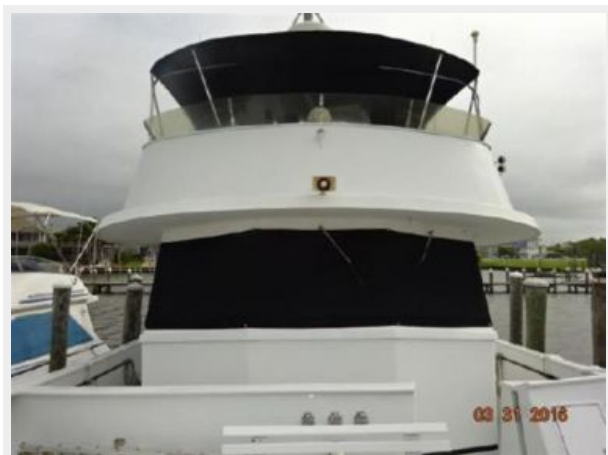
50' Marine Trader foredeck aft