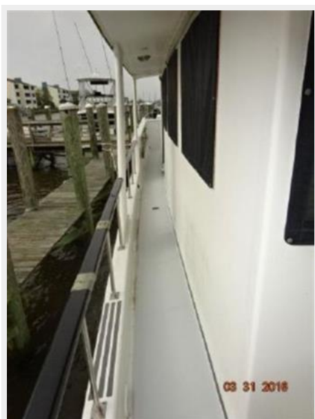
50' Marine Trader port side deck photo2