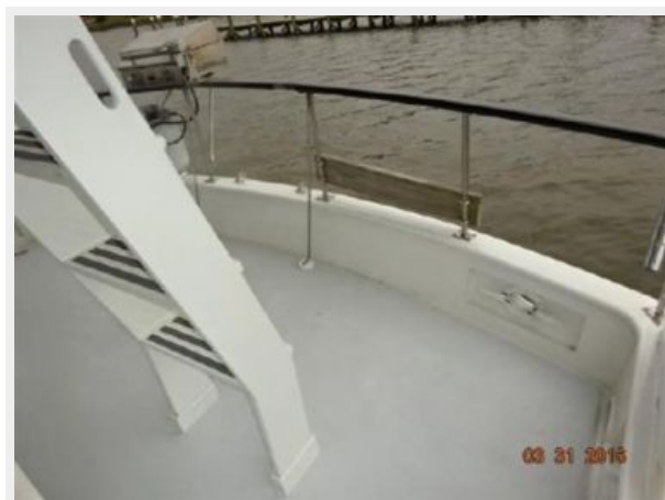
50' Marine Trader aftdeck photo2