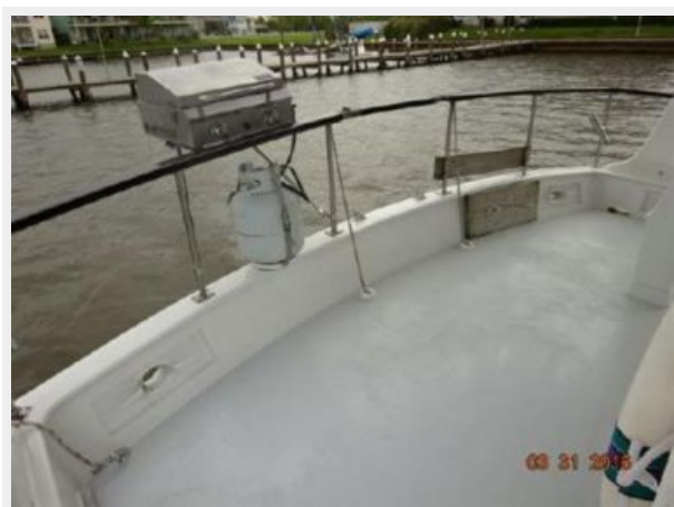
50' Marine Trader aftdeck photo1