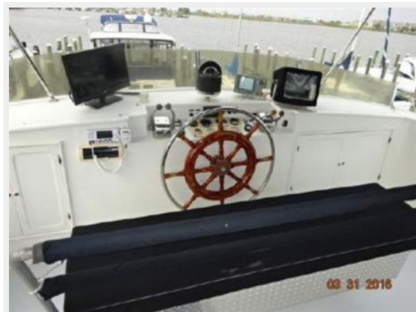
50' Marine Trader flybridge helm