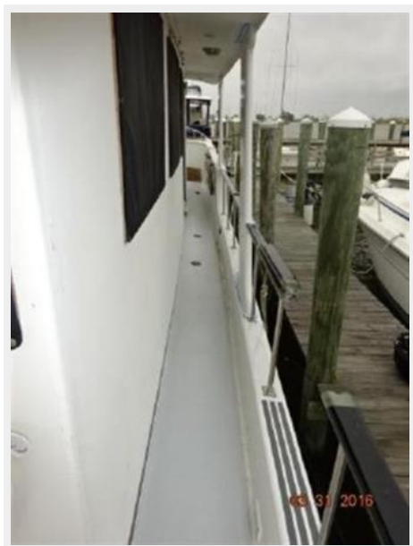
50' Marine Trader starboard side deck photo2