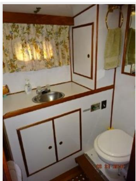
50' Marine Trader VIP guest stateroom head