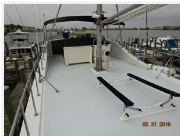
50' Marine Trader flybridge forward