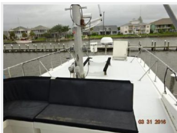
50' Marine Trader flybridge aft