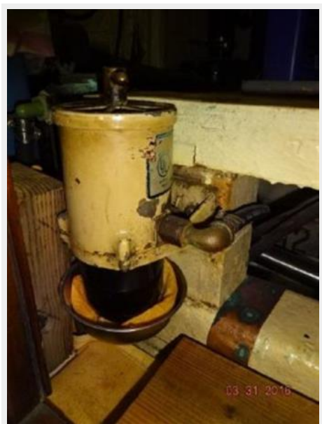
50' Marine Trader port Racor fuel filter