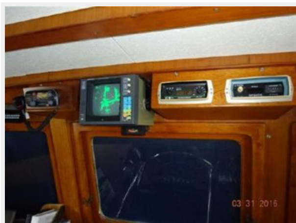
50' Marine Trader pilothouse electronics