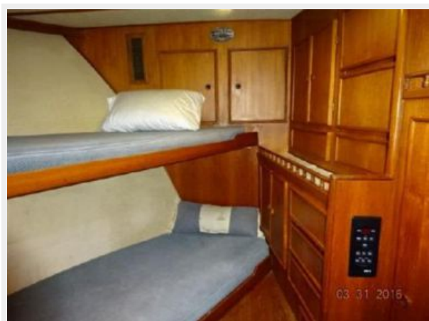
50' Marine Trader forward guest stateroom